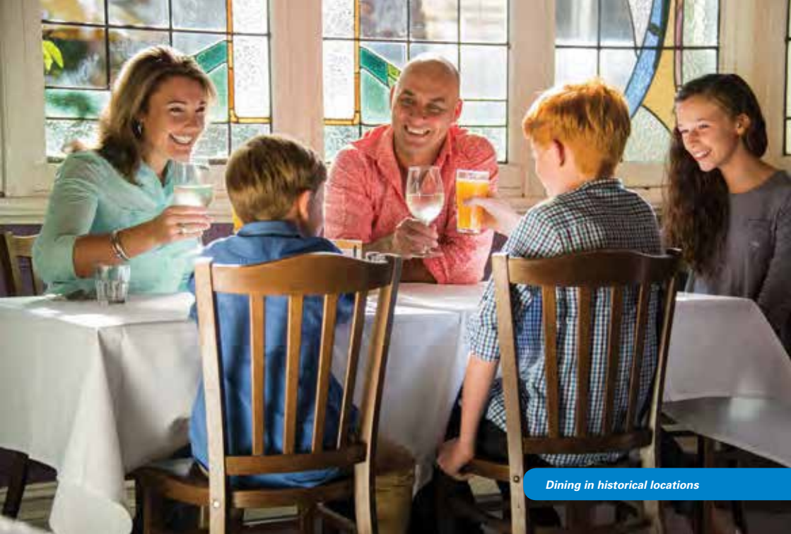
Dining in historical locations