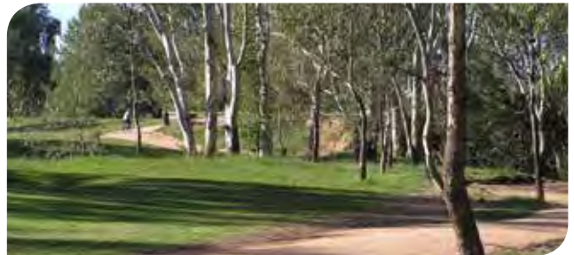
Culcairn's cycle tracks

Referred to as 'The Oasis of the Riverina', Culcairn today is a busy agricultural centre which is enhanced by its heritage buildings, such as the Culcairn Hotel, Memorial Hall, Court House, Railway Station and Station Master's Residence and provides visitors with a range of recreation facilities with football, tennis and netball courts, public swimming pool, golf course, lawn bowls, cricket facilities and walking and