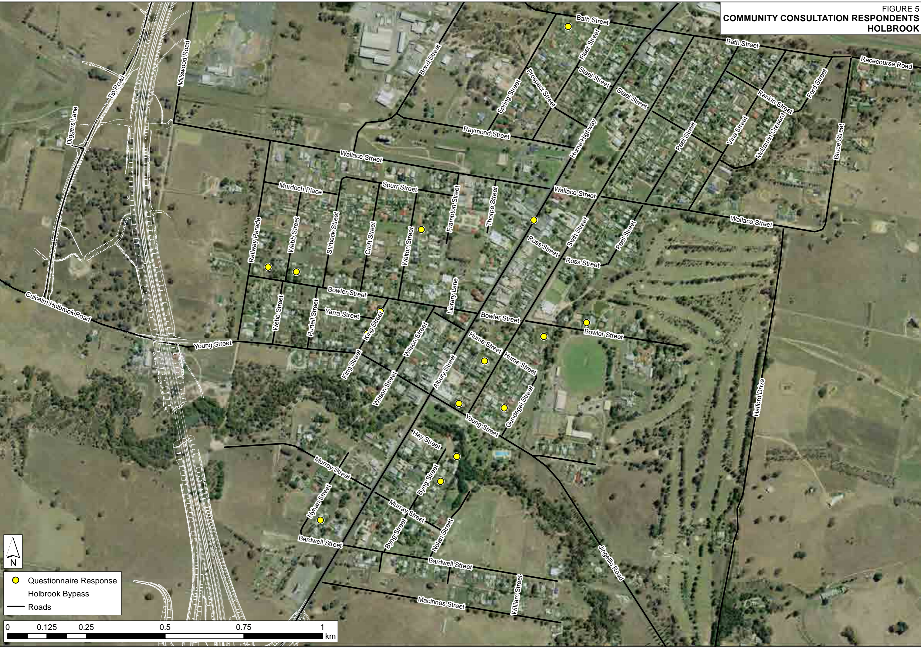
FIGURE 5 COMMUNITY CONSULTATION RESPONDENTS HOLBROOK

J:\Jobs\114040\ARC\Arc_Maps\Holbrook\Report_Figures\28082014\Figure05_Questionnaire_Response_Locations.mxd