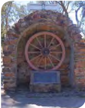
Pioneer Cairn, Jindera