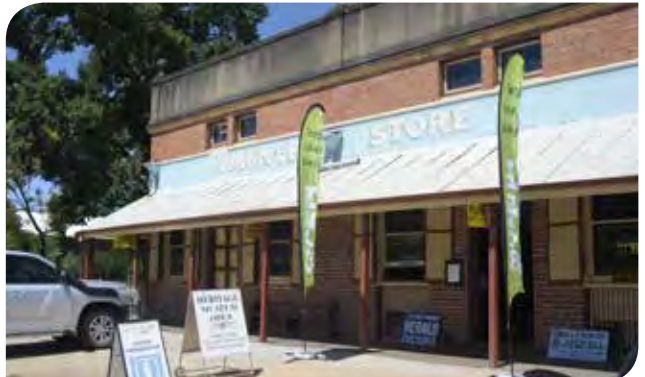
Pioneer Museum, Jindera