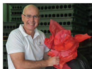
The Red Bow Project So what happened to the plastic?