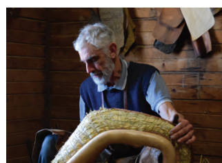
Shire wide shire pride Last full-time long-straw collar maker