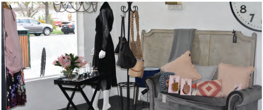
^ Above and above right: eclectic displays entice shoppers to visit and spend