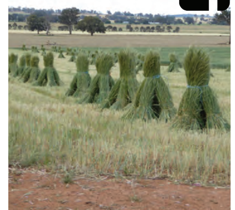
^ Pic: cereal rye, Secale cereale currently being grown at Walla Walla.