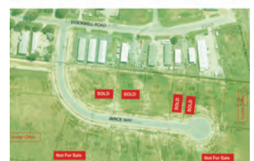
Jindera Industrial Estate Blocks now selling