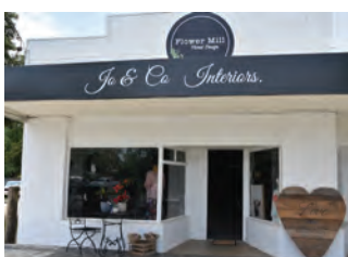
Vibrant new businesses Across Greater Hume area