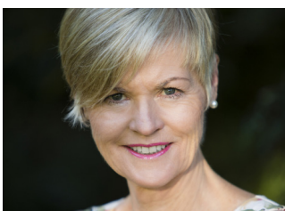
10 years in business Local consultant celebrates