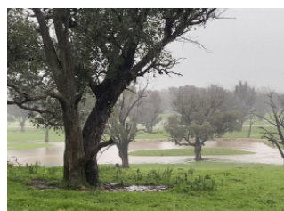
November floods Greater Hume flood assistance