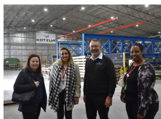
NSW GROW project Project latest news