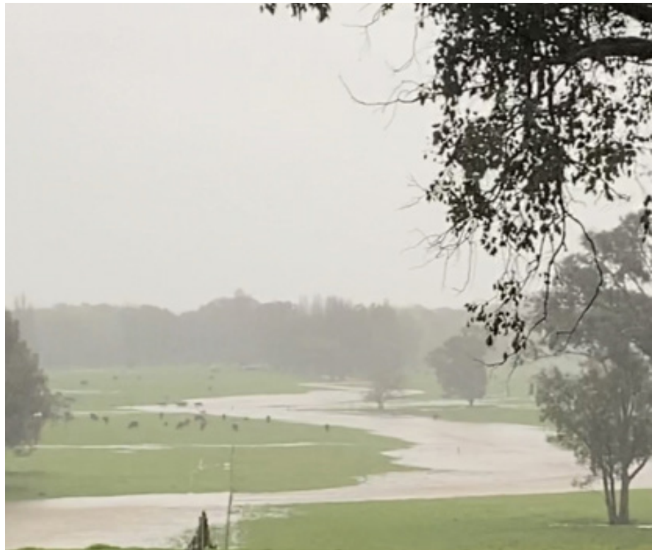
^ Extreme rain falling in November 2021 caused major flooding in Wantagong Valley, Greater Hume LGA