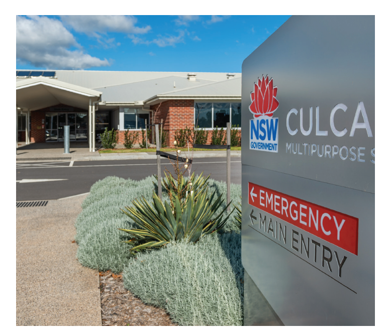
^ Culcairn Multipurpose Service