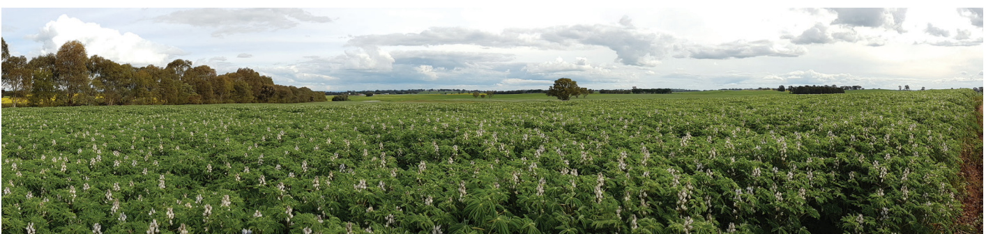
▼ Lupins growing at 'Northwood', Brocklesby