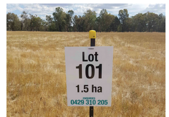
Industrial land available Holbrook and Jindera