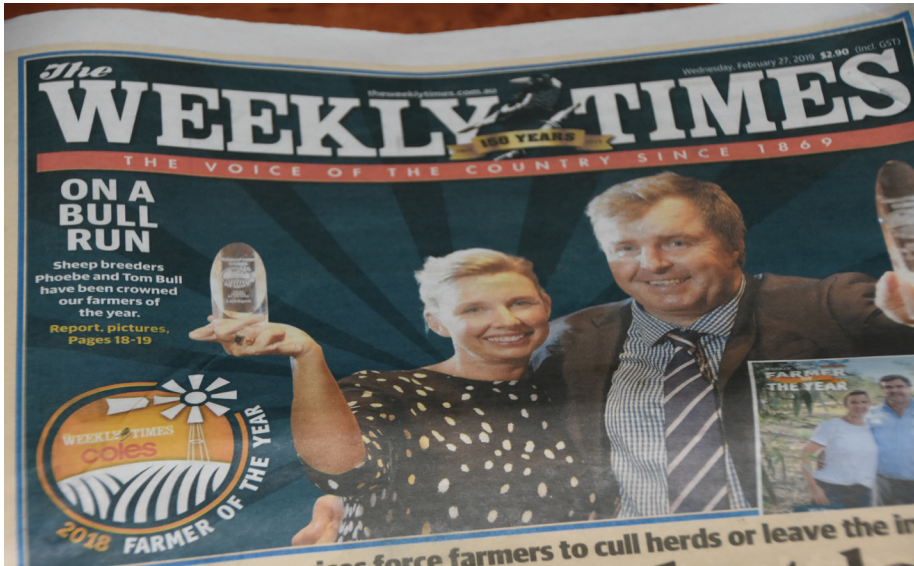
^ Weekly Times front page for Wednesday, 27 February 2019 issue