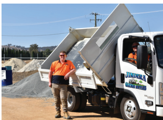
Jindera Garden Supplies Opens in Jindea Industrial Estate