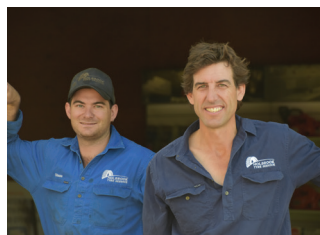
Holbrook Tyre Service New owners take charge