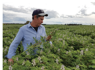
Lupins for Life Paddock to plate success