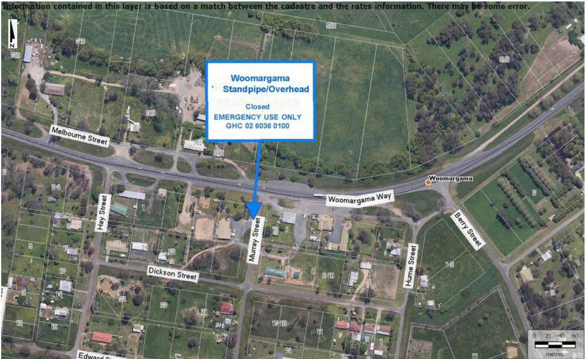
Map 11 - Woomargama Standpipe (See photo Page 23)

Location: Murray Street. Closed/Emergency Use Only