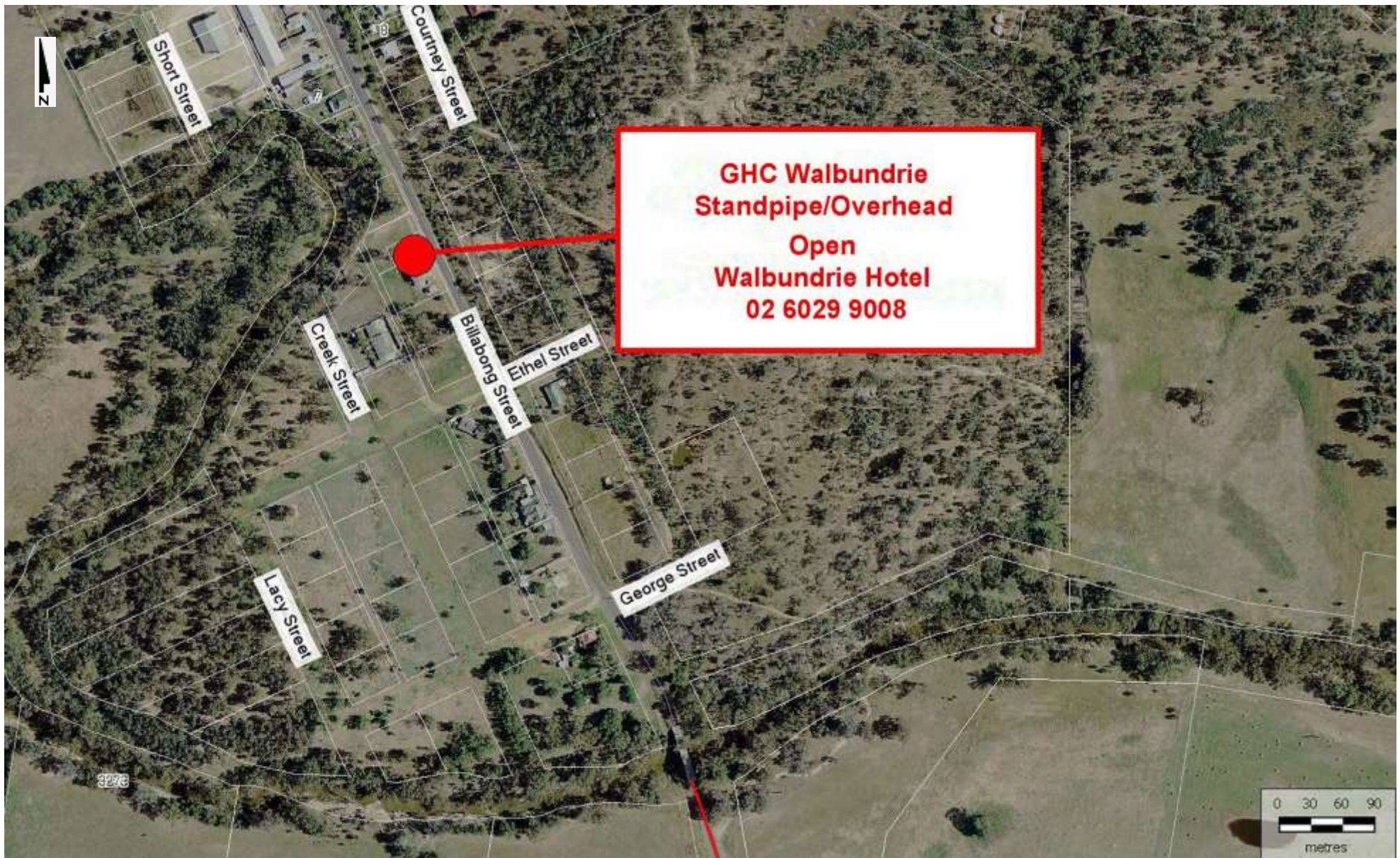
Map 10 - Walbundrie Standpipe (See photo Page 21)

Walbundrie Standpipe Location: Billabong Street at Rural Fire Service Shed. Agent Paul Beesley Walbundrie Hotel 02 6029 9008 Open