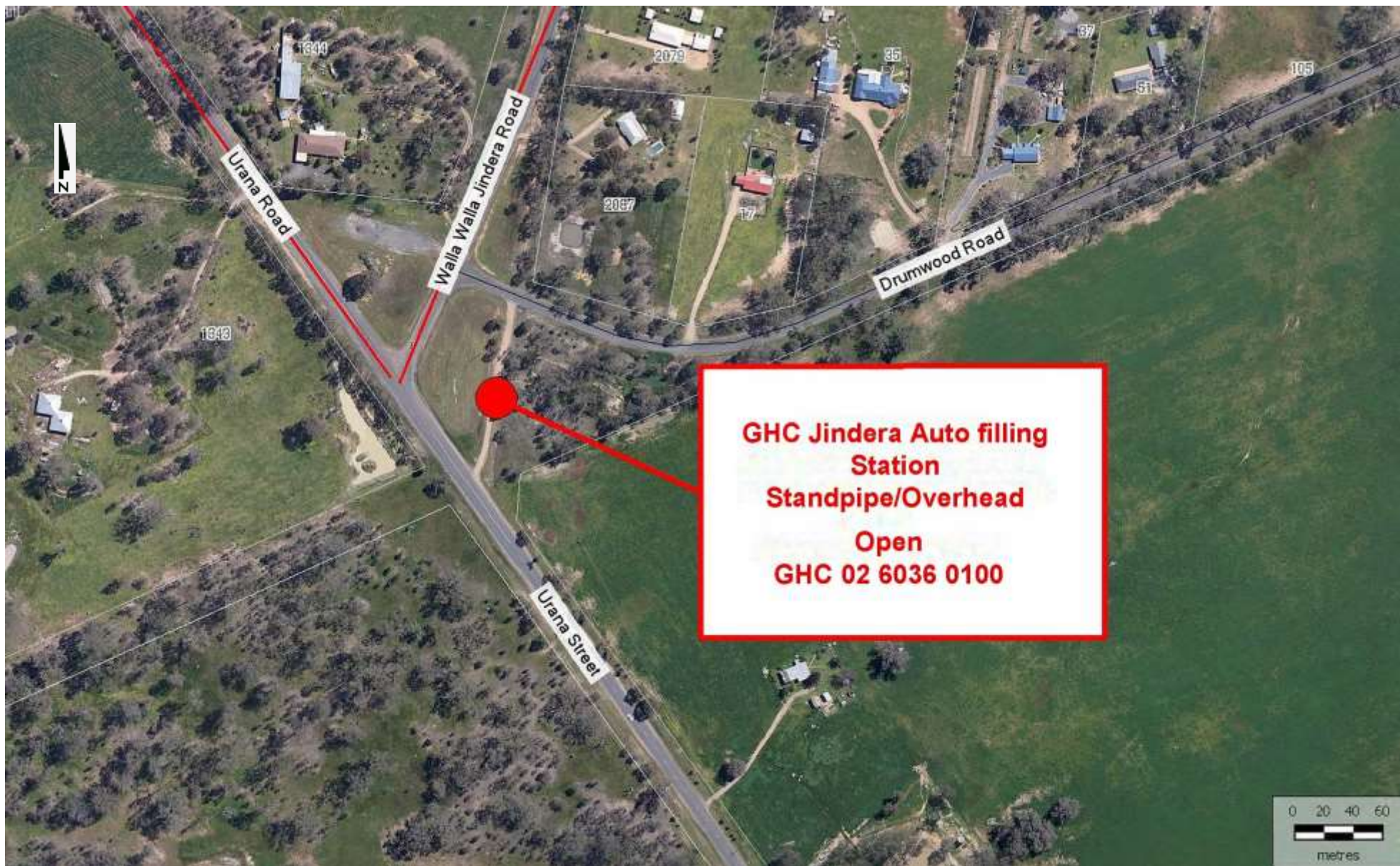
Map 2 - Jindera Auto Filling Station (See photo Page 5)

Location: Corner of Walla Walla Jindera Road and Urana Road. Open