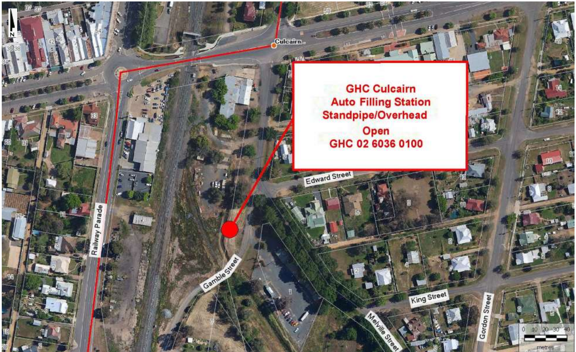
Map 6 - Culcairn Auto Water Filling Station (See photo Page 13)