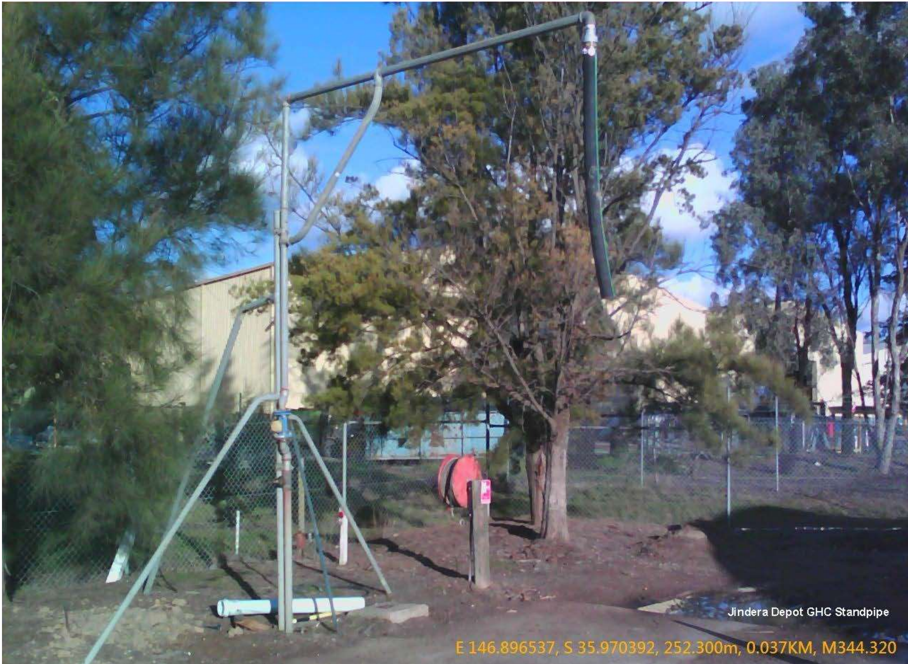
Jindera Depot GHC Standpipe

E 146.896537, S 35.970392, 252.300m, 0.037KM, M344.320