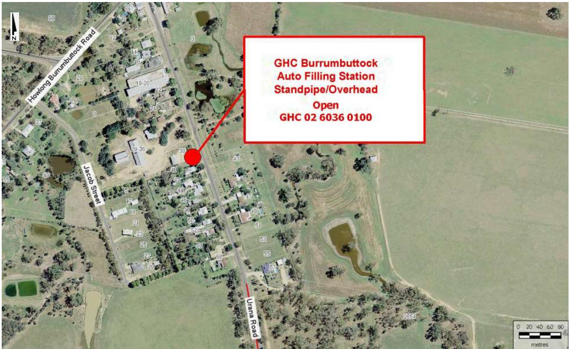
Map 7 - Burrumbuttock Auto Water Filling Station (See photo Page 15)

Location: Urana Road Rural Fire Service Shed. Open