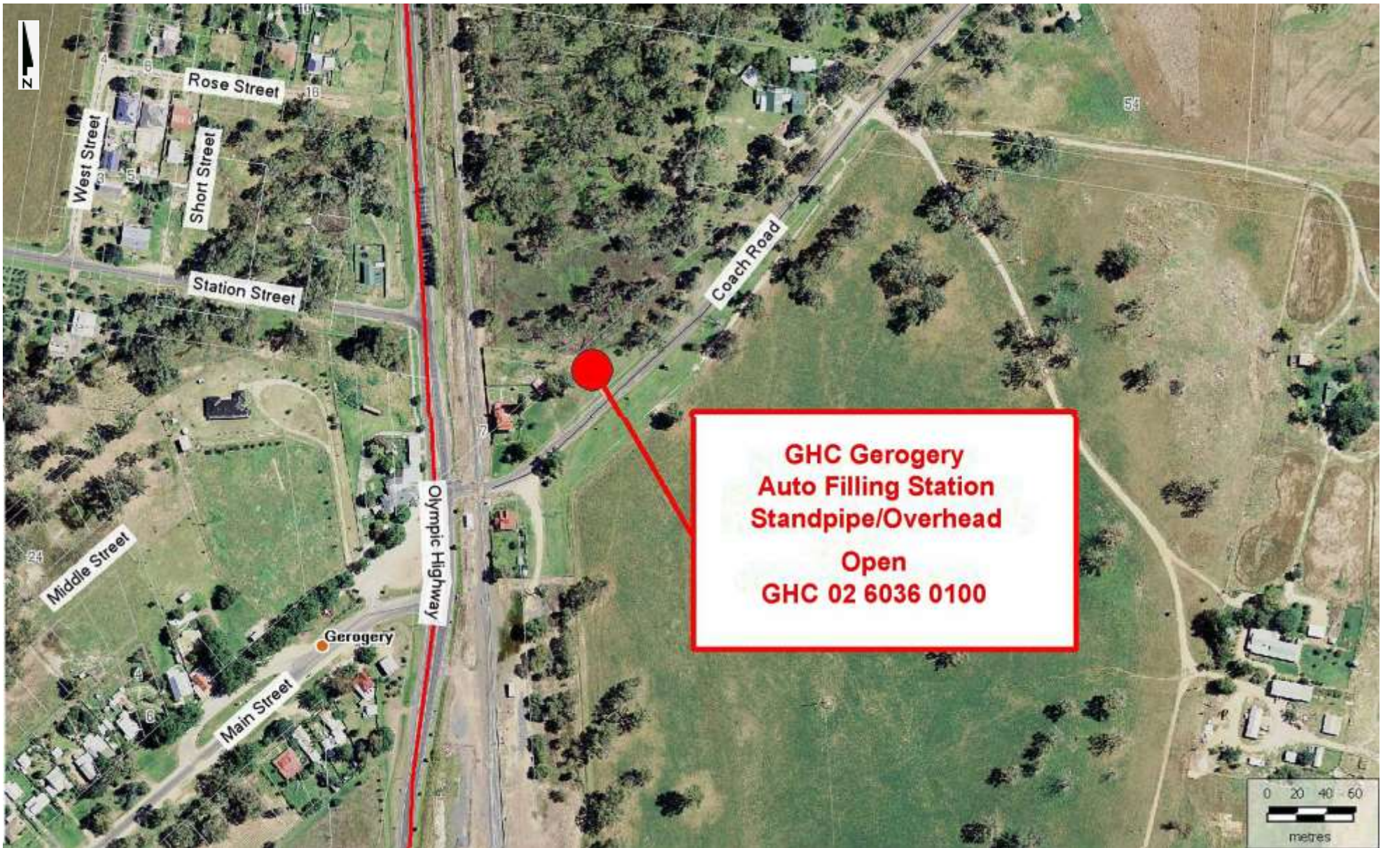
Map 5 - Gerogery Auto Water Filling Station (See photo Page 11)