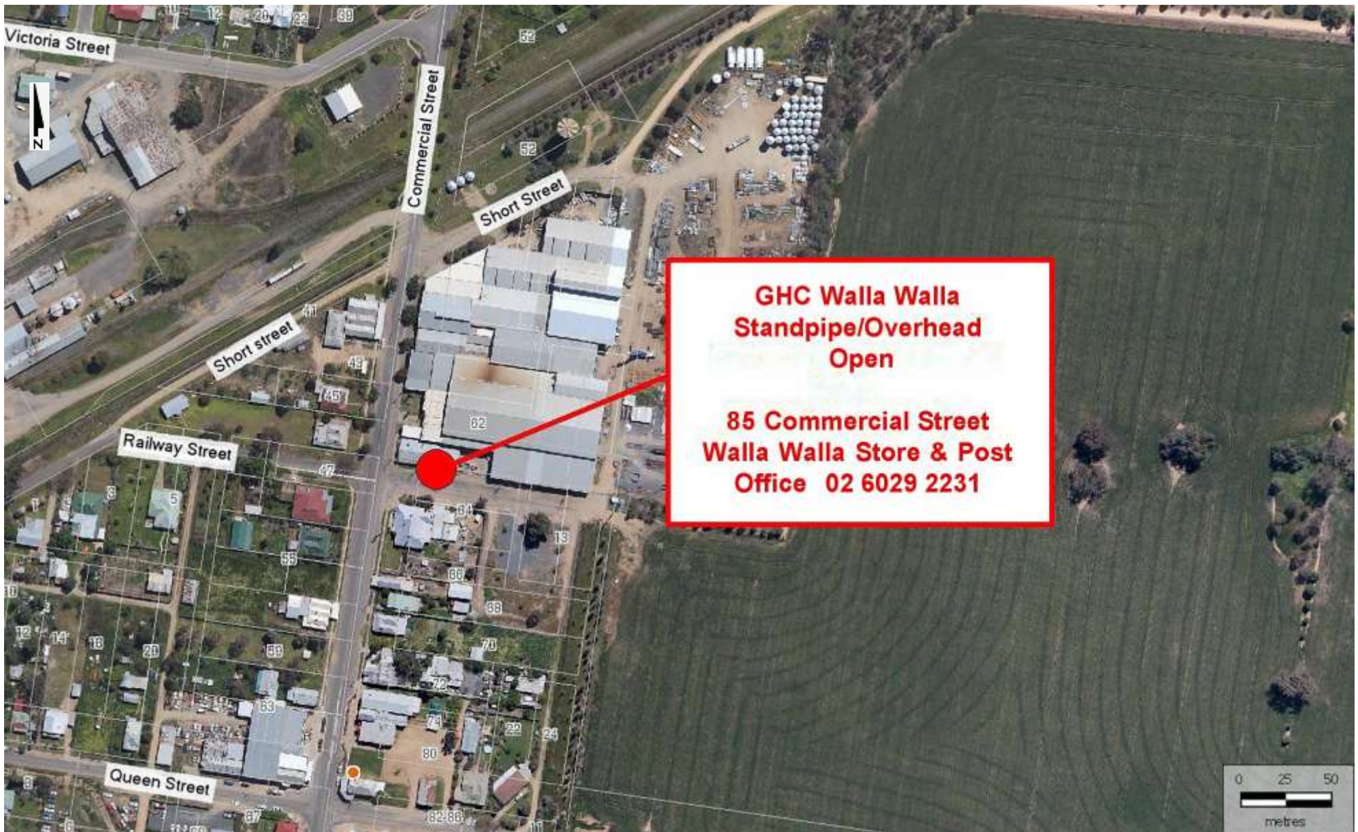
Map 9 - Walla Walla Standpipe (See photo Page 19)

Location: Railway Street beside Landmark. Open