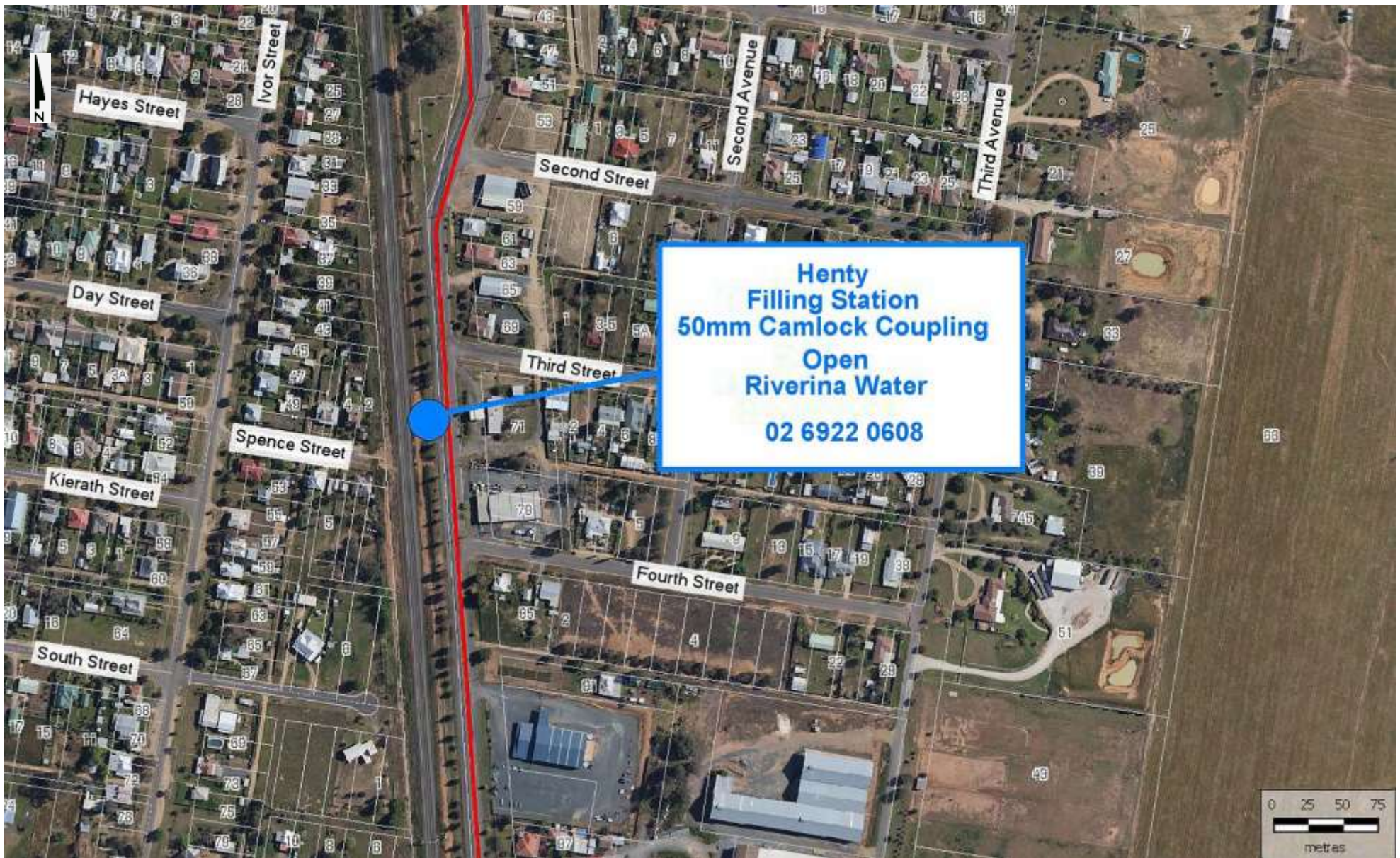
Map 12 - Henty Water Filling Station (See photo Page 25)

50mm Camlock Coupling: Location: between Third and Fourth Street's. Riverina Water 02 6922 0608 Open