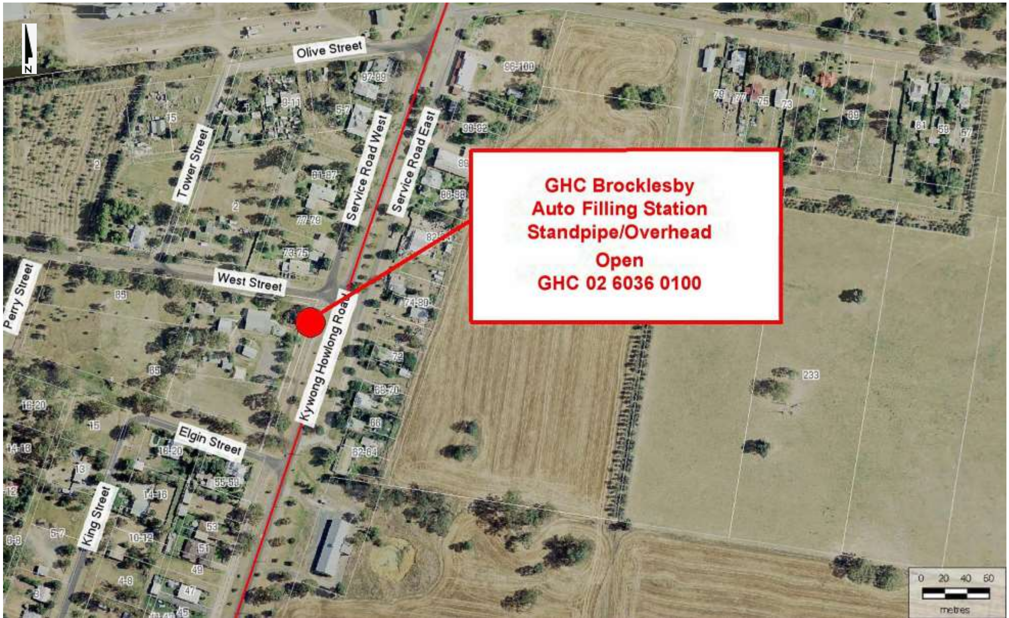
Map 8 - Brocklesby Auto Water Filling Station (See photo Page 17)

Location: Kywong Howlong Road Between West Street and Elgin Street Open