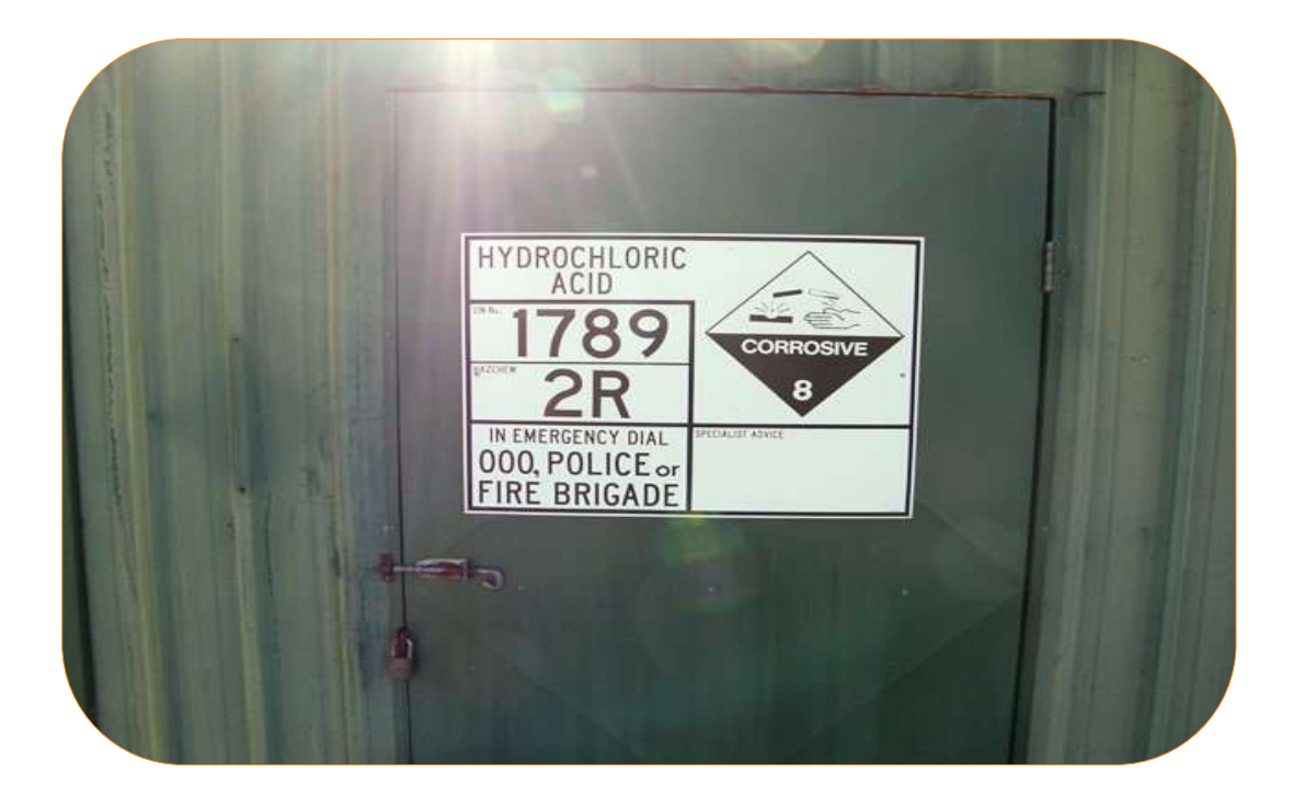
Figure 3: Photos of Signage to Warn the Public of Hazards

In the event of a pollution incident occurring, all site contractors and other Council staff will be mustered by Council site staff to the Emergency Assembly Point adjacent to the site entrance, after which they will be safely evacuated from site where appropriate. It is a condition of entry that in the event of an emergency, both site contractors and staff must adhere to directions given by the Site Supervisor.