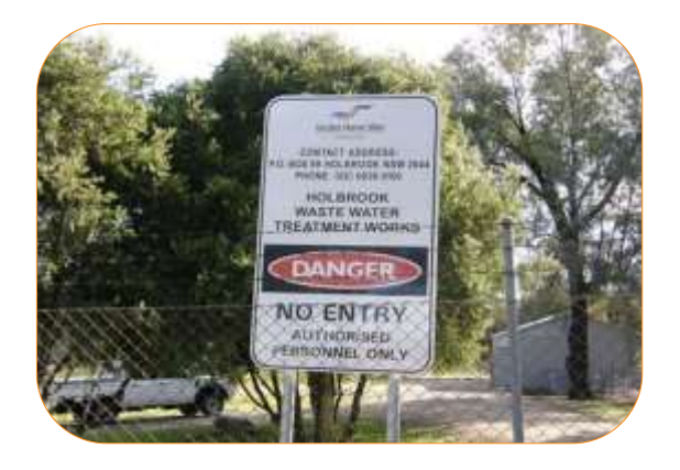
Figure 3: Photos of Signage to Warn the Public of Hazards

In the event of a pollution incident occurring, all site contractors and other Council staff will be mustered by Council site staff to the Emergency Assembly Point adjacent to the site entrance, after which they will be safely evacuated from site where appropriate. It is a condition of entry that in the event of an emergency, both site contractors and staff must adhere to directions given by the Site Supervisor.