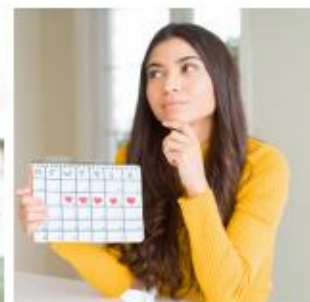
Pics Baby in nappy and Woman with Calendar.