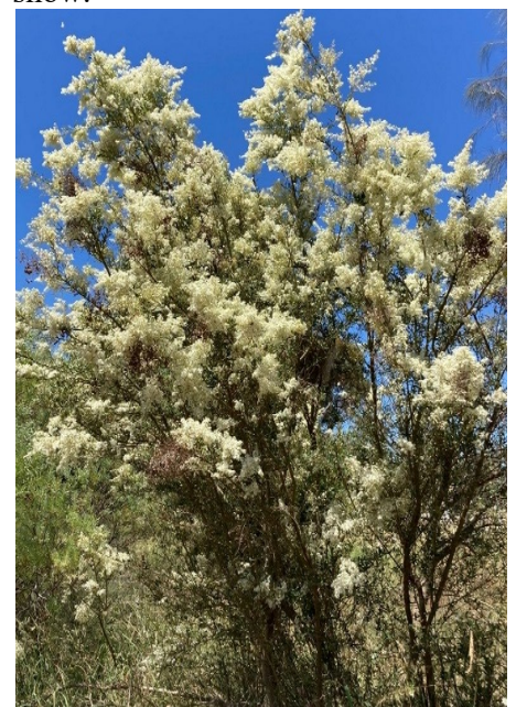
Bursaria in full bloom and lots of pilinaror