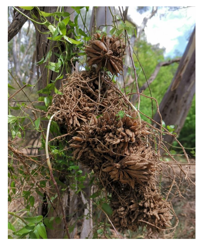
Bridal Creeper tubers and leaves

Bridal Creeper ( Asparagus asparagoides is a noxious weed of National Significance and is a major weed of natural bushland in Southern NSW. It was very dominant along the dam bank when we started to work in the park. It is a perennial climber that can smother neighboring plants. It is very tough and has mats of underground tubers that re-sprout every year. Weeding the visible plant is useless as the tubers will just re-grow. The only way to remove it is to unearth and remove the mats of tubers,