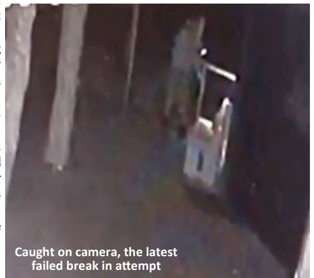
Caught on camera, the latest failed break in attempt

Regrettably, none of this information can be tied to the original break-ins which occurred before the CCTV was installed.