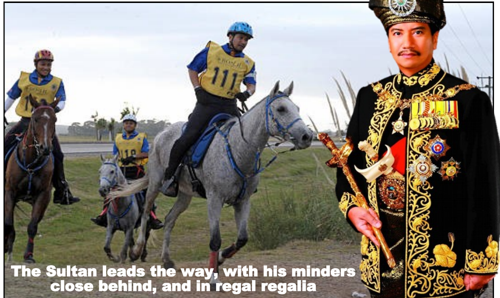
The Sultan leads the way, with his minders close behind, and in regal regalia