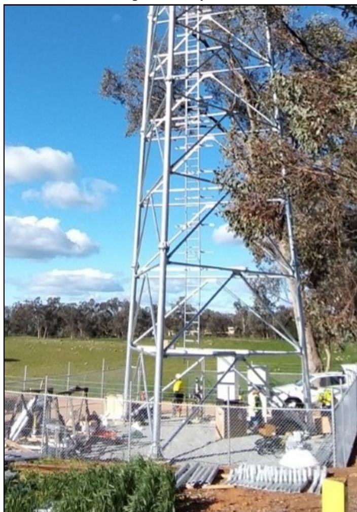
Work on the erection of the NBN tower in Brocklesby Road began in the last week of August. The contractors expect to have it up by the end of September. Just when it will be commissioned is unknown.

Community grants from the Bushfire Community Recovery and Resilience Fund (BCRRF) have been approved to the value of $26,190.36 have been approved for the Wantagong and Wymah/Bowna RFS Brigades along with Holbrook Meals on Wheels.