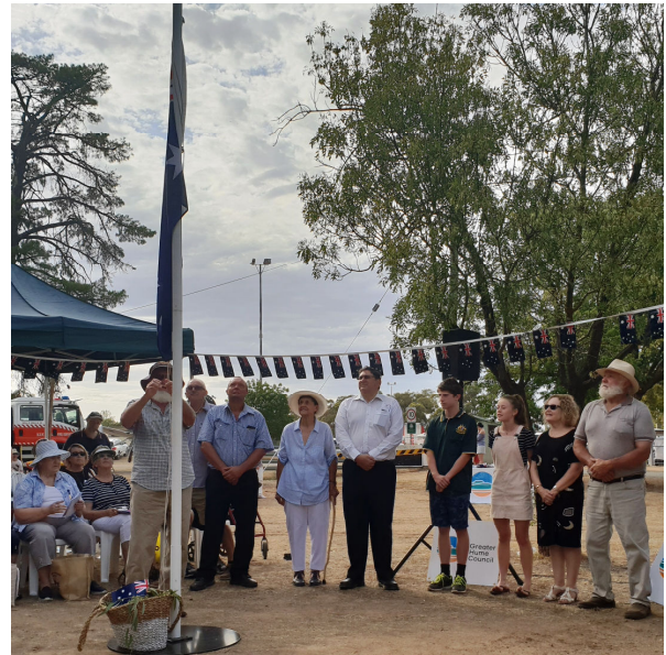
Descendants' of the 9 families who settled Walla Walla raising the flag