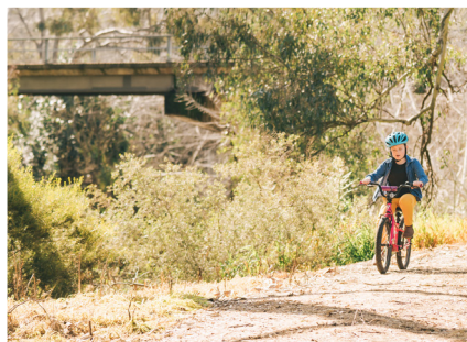
Pic Culcairn Bike and Walking Trail

All of these projects will boost the wellbeing of the towns we call home and this new investment will support grassroots projects to reinvigorate rural communities.