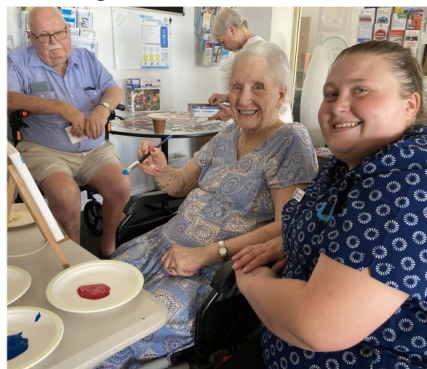
Pic Senior's Week at Henty

Thank you to everyone who attended the Festival of Seniors events across Greater Hume and to community members who worked with library staff to organize the amazing events.