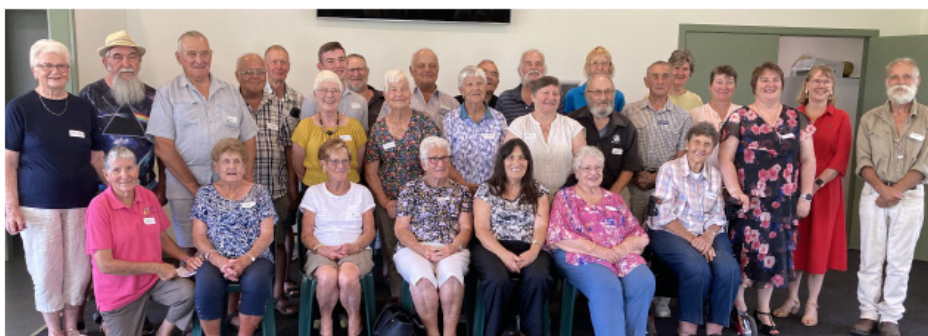
Pic Senior's Week at Walla Walla