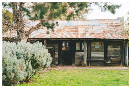
Pic The slab hut, Jindera Pioneer Museum

To find out more information head to www.visitgreaterhume.com.au .