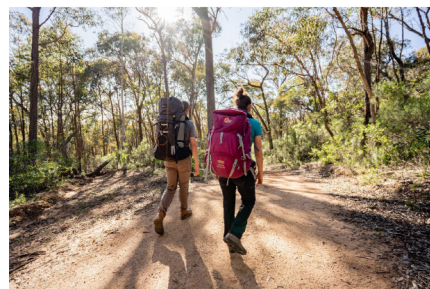
Pic Hume and Hovell Walking Track, Woomargama National Park