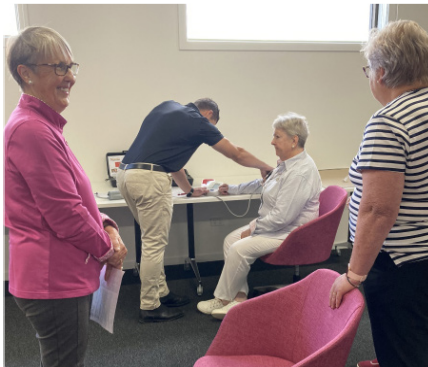
Pic Waiting for health checks - Senior's Week at Holbrook