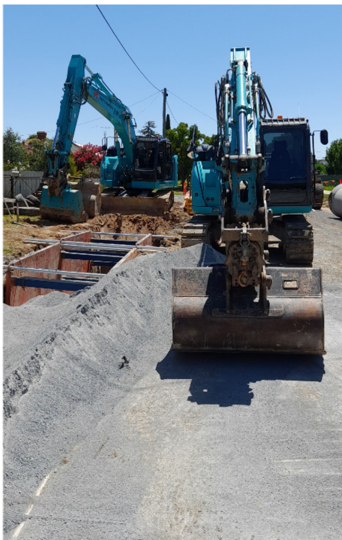
Pic Currently working on Culcairn Drainage along Fraser Street and Balfour Street

When driving farm machinery on public roads, harrows and other devices should be raised off the ground.