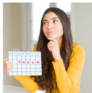
Pics Baby in nappy and Woman with Calendar.