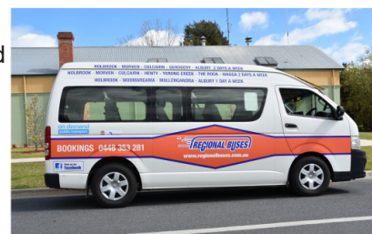
Pic The Regional Bus available in many Greater Hume locations.

Contact Matt on 0447 354 357 for more information or find 'Regional Buses' on Facebook.