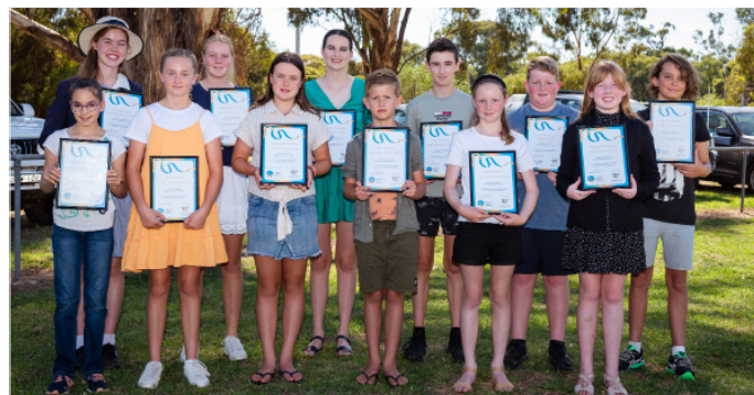
Pic Greater Hume's School Citizenship Awards