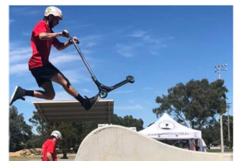
7 Greater Hume Skate parks Where are they? Jindera is just one of them.