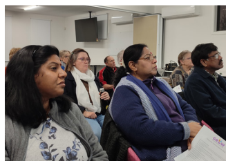
3 NSW GROW Community Information Sessions in Greater Hume.