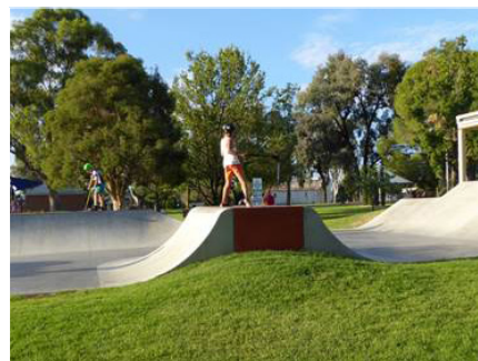
Pic Henty skate park

The skate parks in Culcairn, Jindera and Walla Walla are all located within their towns' sportsgrounds, making them an ideal spot to mix up your sports, burn some energy and of course show off your tricks. You can find the Culcairn skate park down Federal Street, the Jindera skate park down Urana Street and the Walla Walla skate park in William Street.