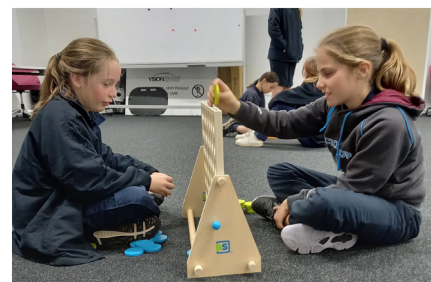
Pic Children playing Connect Four.

For further information contact Greater Hume Council Libraries. Bookings are essential.