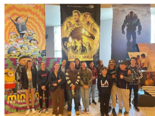
7 Youth News What's the fun planned in the Spring Holiday's for Greater Hume youth.