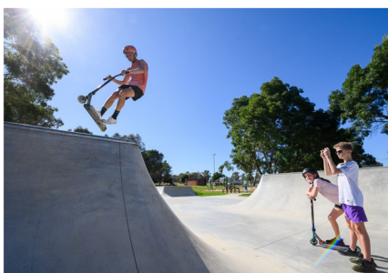
Pic Walla Walla skate park

With a skate park in our towns of Culcairn, Henty, Holbrook, Jindera and Walla Walla, why not get out and about and try a session at each and discover the different obstacles. Each park has been carefully designed to include different ramps, jumps and rails to suit every skater.