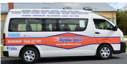
Pic The Regional Bus available in many Greater Hume locations.

Post your images to Facebook or Instagram with the tag #visitGreaterHume or #visitCulcairnHentyHolbrookJinderaWallaWalla.