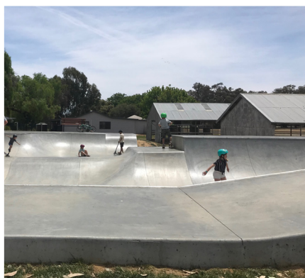
Pic Culcairn skate park