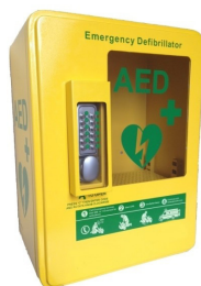
Pic A Defibrillator

For more information contact Council on 02 6036 0100.