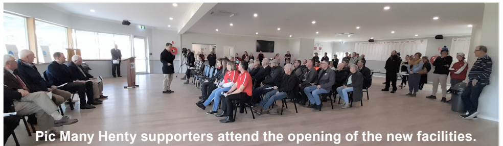
Many Henty supporters attend the opening of the new facilities.

This outstanding project has been made possible through funding and support from the Australian and NSW Governments, Henty Community Bank branch of the Bendigo Bank, NSW AFL, Riverina Water, Henty Sportsground and Showground User Groups and Greater Hume Council.