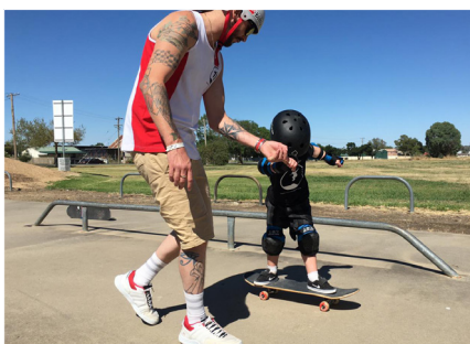
Pic Holbrook skate park

Another exciting announcement from Greater Hume Council is that Al's Skate Co has also been successful in obtaining NSW Government funding to hold Skate and Scooter Workshops in Greater Hume skate parks for those avid skateboarders and scooter riders, keep your eye on the Greater Hume Council Facebook page for dates and times at your local skate park and come along for a day of fun in Greater Hume.