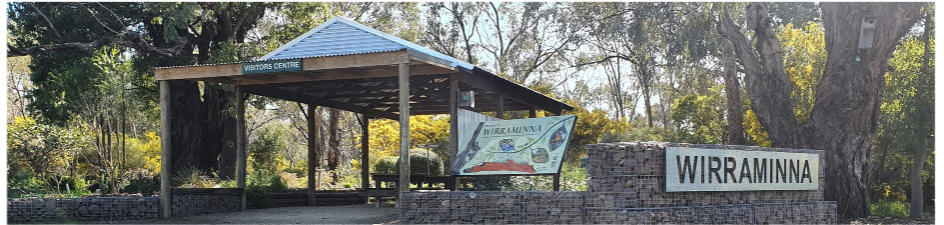
Pic Entrance to Wirraminna Environmental EC, Burrumbuttock