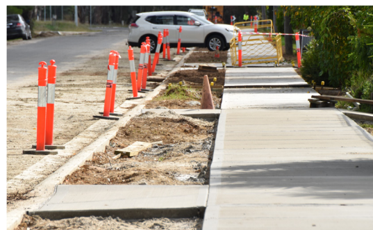
Pic Construction of a footpath, Pioneer Drive, Jindera.

When driving farm machinery on public roads, harrows and other devices should be raised off the ground.