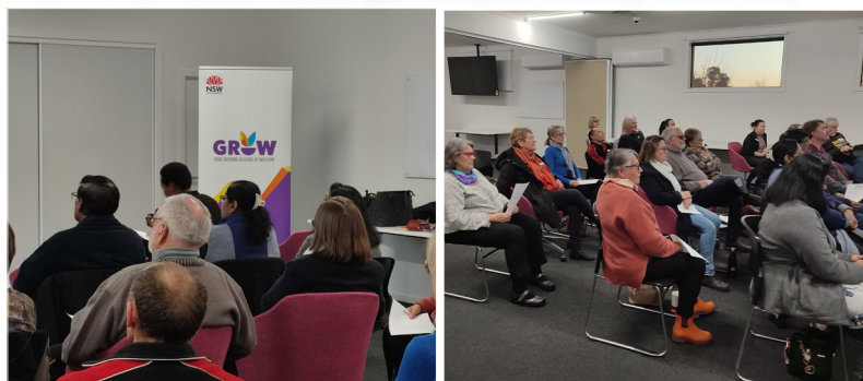
Pic NSW Grow workshops were well attended by Greater Hume residents.

https://multicultural.nsw.gov.au/nsw-grow