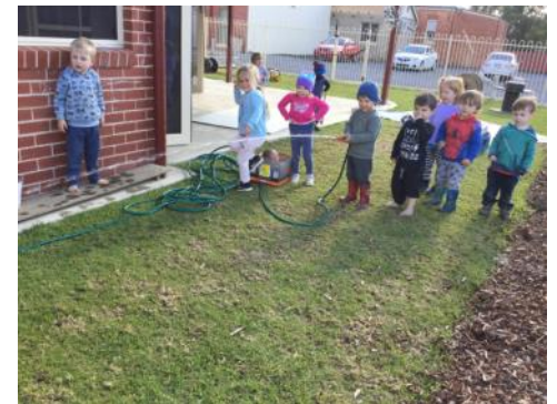
Children were putting a fire out targeting the flames on top of pile of bucket

We would like to thank the Lieschke Company for picking up the schoolies daily from our service and delivering them to the school. This provides the opportunity for them to reinforce their autonomy and responsibility. Schoolies have been very excited to engage in this daily