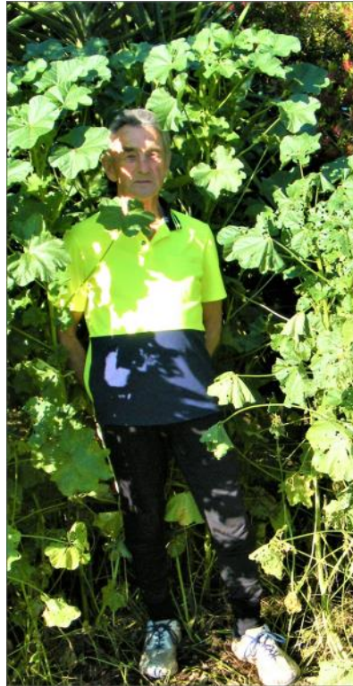
Herb standing near a well nourished marshmallow plant

Marshmallow is still growing nicely. See photo with me standing in front of a very fine specimen, growing in our town area. The Internet states it grows to one metre high, but we can produce much better than that! This weed will be with us for some months yet, with small whitish flowers a bit later. Someone suggested using a chain saw for big plants! That will certainly work, but that is a bit heavy handed! Small plants pull out easily, but larger plants need a pretty heavy, sharp tool for their demise. Spraying large plants with normal spray is a waste of time.