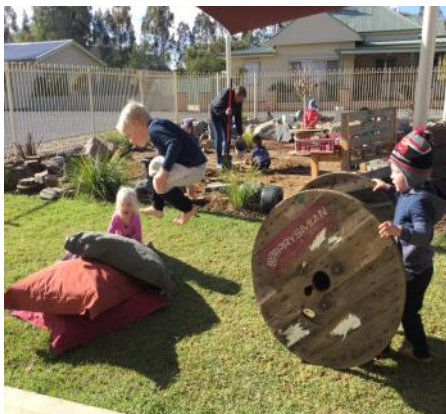
Practising our fundamental movement skills: Jumping