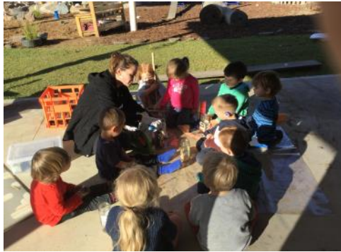
Investigating how to grow pumpkin seeds

We started the month by celebrating Nature and Ocean Day, respectfully on the 5th and 7th June, under the theme of Biodiversity. The children had the opportunity to engage in being responsible and connected to their physical and built environment. Children were wearing green on this day and have explored a video with biodiversity and learned on how to be more responsible such as: turn the light off, investigating the process of growing potatoes using recycled water for them. We also pretend to be birds and butterflies.