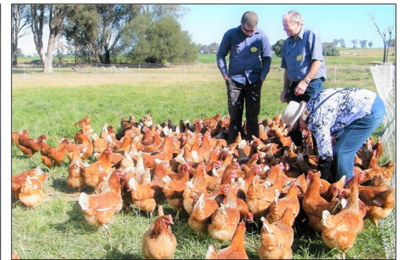
The chooks wanted to get up close and friendly with our group.