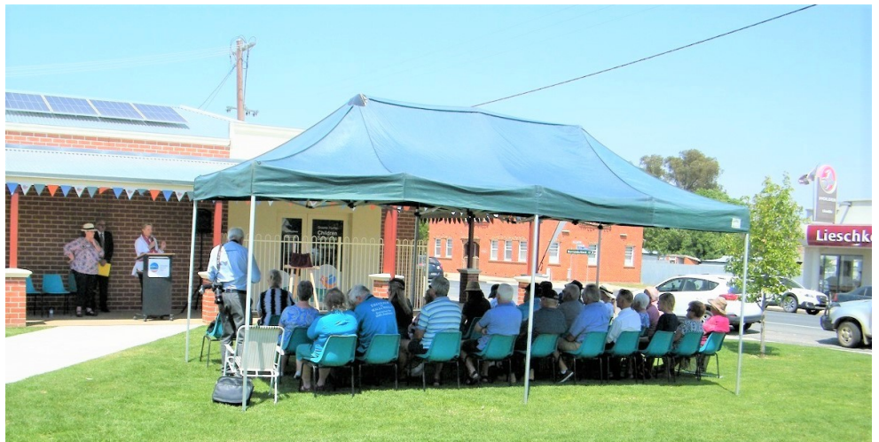
M.P. Sussan Ley is making her speech before opening the building. Behind her are Council General Manager Steven Pinnuck and the Mayor Heather Wilton. Some locals can be seen under the canopy, and many more were behind the camera.

The Honourable Sussan Ley, MP, Member for Albury and Federal Minister for Environment and Mayor of Greater Hume Council, Councillor Heather Wilton, formally opened the new early childhood centre. The $900,000 building was jointly funded from all three levels of government including: $277,000 from the Australian Government's Building Better Regions Fund, $252,225 from NSW Government's Stronger Country Communities Fund,