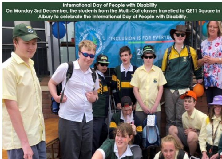
International Day of People with Disability On Monday 3rd December, the students from the Multi-Cat classes travelled to QE11 Square in Albury to celebrate the International Day of People with Disability.