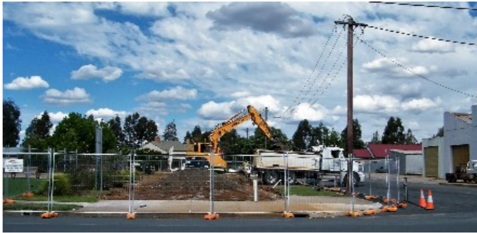
ABOVE: Going, going, gone!