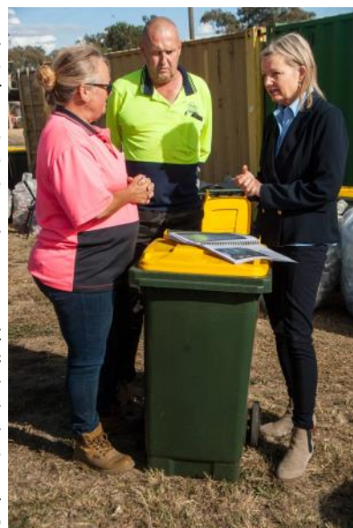
Visit from Sussan Ley

There is no comparison between our service and the reverse vending machines in Albury. The site is clean when we leave at night and nothing except large rolls