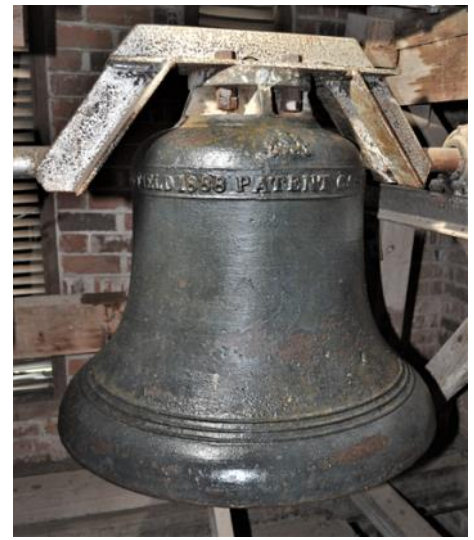
The bell as it is mounted in the current church. Note the off-centre headstock that was added in later years.

Aside from church services, the bell was tolled for special occasions. Following the announcement of the death of Queen Victoria in 1901 the bell was tolled, and after a special memorial church service at a later date, the bell was tolled again. Following the death of her son, King George VII in 1910, a mourning service was held on 18 th May, and the following Friday the bell was tolled. To celebrate the end of World War 1, the bell was again tolled in conjunction with the bell at the Presbyterian church, followed by a performance from the Walla Brass Band. Of course, the bell has been tolled for many funer-