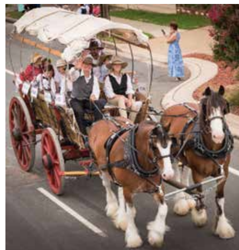
Above: Walla Walla 150th parade led by the Heritage Wagon

The committee went over every nook and cranny with critical eyes, grease jars, dust rags and tools to make sure the old wagon looked at her absolute best for the big day. Likewise, the horses had spent many hours being driven in harness through town to acclimatise them to every sound and sight they were likely to encounter on the route. As with the wagon, they were polished and scrubbed thoroughly to look gleamingly beautiful on the day with their hairy legs being dazzling white and harnesses a shiny black.