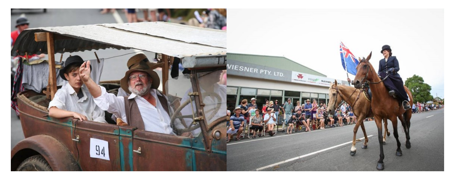
Above and preceding pages: WALLA WALLA 150th ANNIVERSARY STREET PARADE ON 27th OF JANUARY, 2019