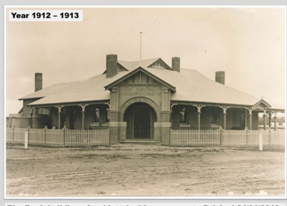
he Bank building after historical improvements finished 24/01/201