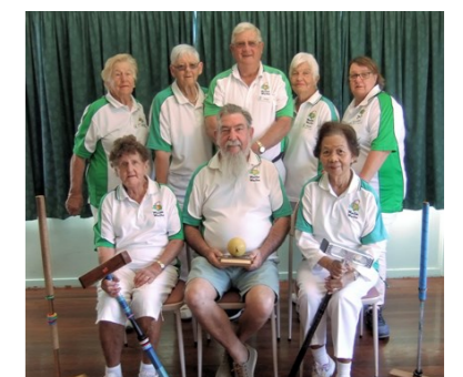
Above: "Battered Ball" winners 2019