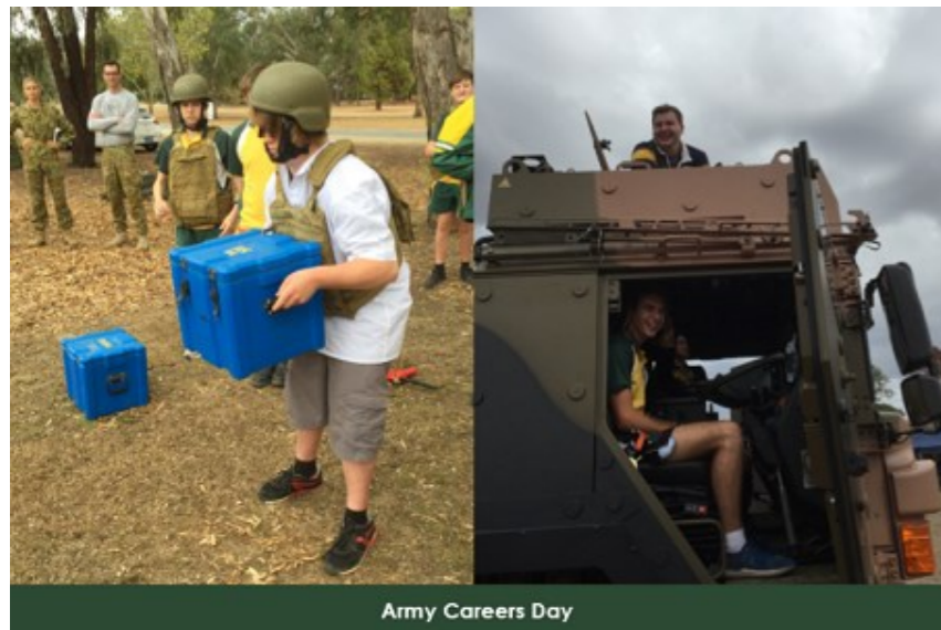
Army Careers Day

Army Careers Day On Friday, 29 March eighteen students from Year 9-12 attended the Army Careers Day at Latchford Barracks Bonegilla to learn about all the career options available in the Defence Force. Students viewed and participated in many areas within the Army – Electrical, Mechanical, Health, Transport, Field Cooking, Ordinance, Weapons Display, and Personal Training. All students enjoyed their experience in the Weapons Simulation firing range.