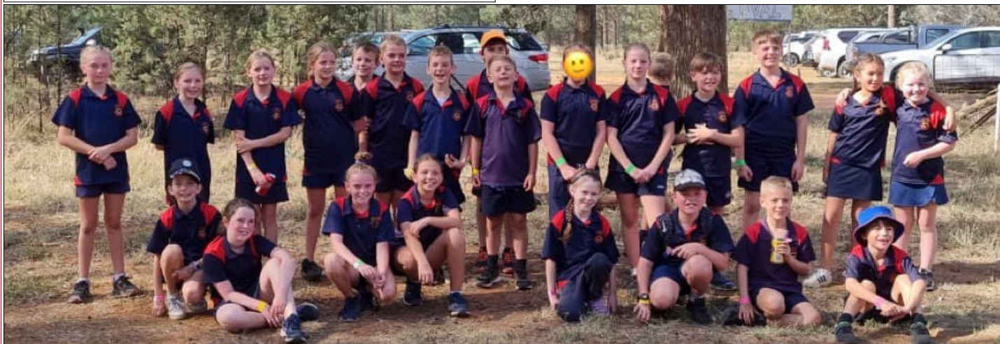
Southern Riverina Cross Country Team