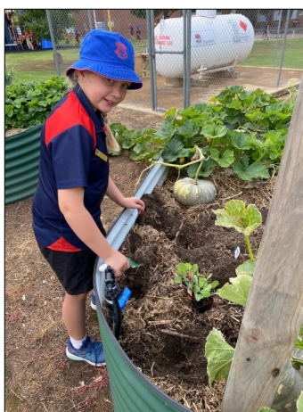
Henty Public School garden in full bloom

The Catering Committee are starting to ramp up their advertising for helpers at this year's Field Days, to be able to supply the school with updated technology and other upgrades around the school, including a new kitchen. If you are able to help out even for a small amount of time they would love to hear from you. Flyers and volunteer forms will be out in the mail soon.