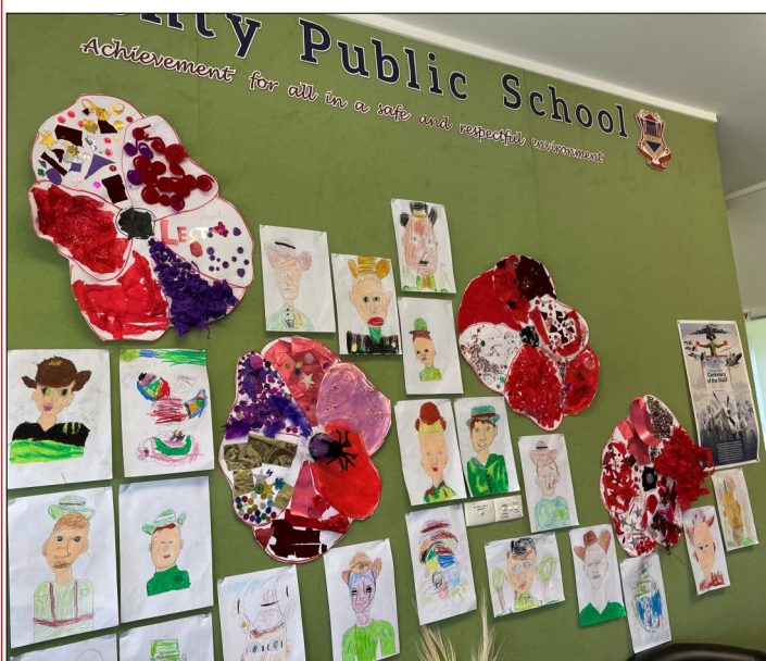
ANZAC Day art display