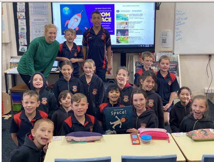
National Simultaneous Story Time