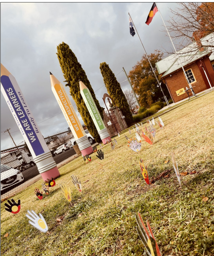
National Sorry day

cilities, making the day easier to run. Twenty-six student athletes will now compete in Albury at the Southern Riverina Athletics competition in July.