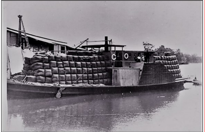
PS "Murrumbidgee with a load of wool bales.

the river levels were high, they could reach Albury, on the Murray, Gundagai on the Murrumbidgee and Walgett on the Darling. The Murray, 2,500 kms in length and the fourth longest river in the world was navigable for over 2,000 kms in good conditions!