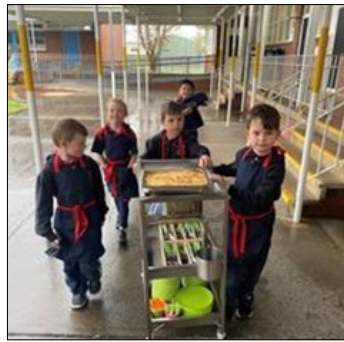
Kindergarten delivering lunch

the new kitchen. Providing the whole school with a lunch every Thursday. Students have been able to try food they may not have necessarily eaten at home or tried before. All students are encouraged to try the meals and there has been some coming back for a third round it has been so delicious.