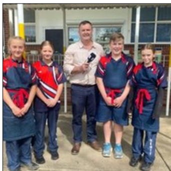
ABC interviewing students for the Stephanie Alexander Cooking Program

The Stephanie Alexander Cooking Program has been very successful this year.