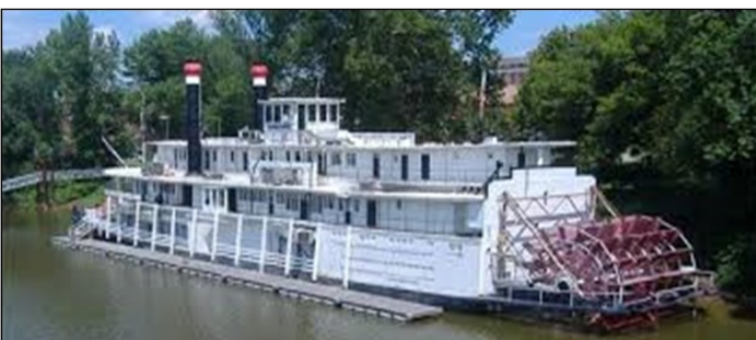
P.S "Adelaide" on a cruise down the Murray River

At the peak of the river trade era there were nearly 300 steamers operating on the Murray/Darling system alone. Most began service as barges and were often converted back to this function as the river trade waned. Some became fishing boats, log carriers and passenger vessels. They were purpose-built for their shallow draught which meant that they were not suitable for use in open waters due to the likelihood that they would capsize.