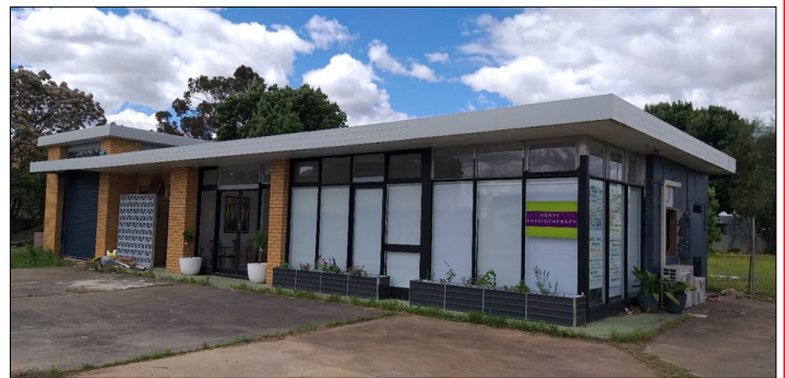
Renovations underway for old servo.

Next year, there are plans to hopefully put in a laundromat, electric vehicle charging station and to use some of the outside space to house and sell chickens.