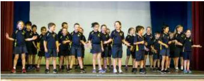
Year 1 performing at the Flower Show

Grandparents Day was attended by a large number of grandparents, parents and friends, on Friday 26 November. Year 1 treated us to a great assembly, and this was followed by a delicious morning tea, for all our visitors. Thank you to all the parents who contributed goodies for this event, and to our ever present and busy P&C. Kinder, Year 1 and 2, then went to the Flower Show to perform. What a big day!