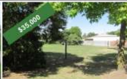
18 Bath St, Holbrook