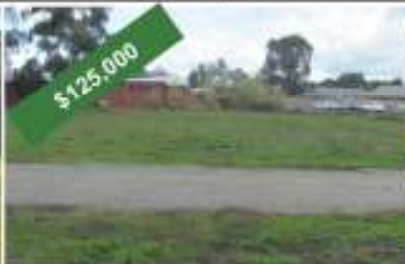
22 Thorpe St, Holbrook