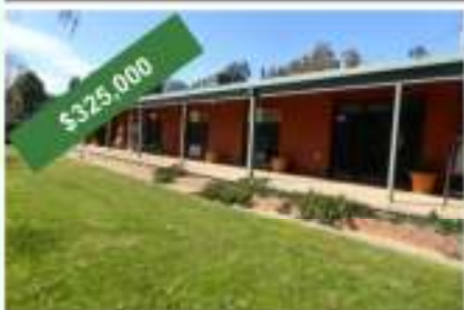
26 Dickson St, W'Gama