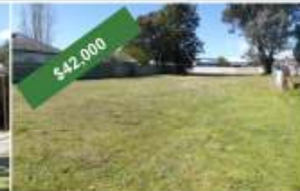
150 Albury St, Holbrook