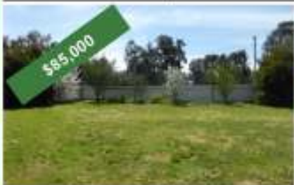
24-26 Bath St, Holbrook