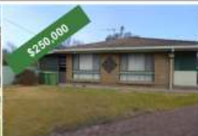
31 Webb St, Holbrook