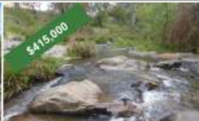
39 Lochiel Rd, Lankeys Creek