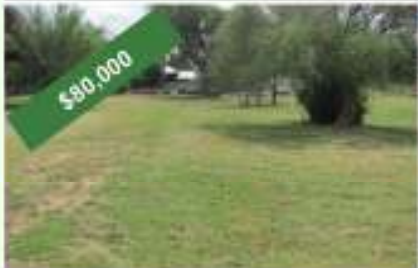
3-5 Bowler St, Holbrook