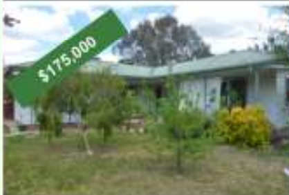
44 Swift St ,Holbrook