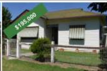
92 Swift St, Holbrook