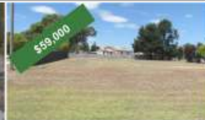
164 Albury St, Holbrook