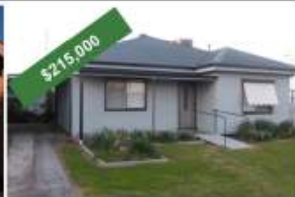
150 Albury St, Holbrook