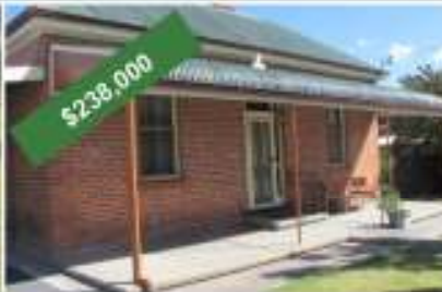
22 Bardwell St, Holbrook