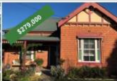
22 Swift St, Holbrook