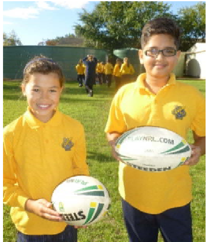
Year 6 enjoying the NRL clinic

The Cross Country is to be run next Friday, 17 May, at Bowna Waters Reserve. The date had to be changed from 10 May, due to inclement weather. Our Boccia team will represent our school on Friday May 17, at Wagga Wagga High School.