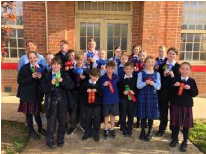
Our Age Champions and ribbon placegetters from the Combined Schools Athletics Carnival with St Joseph's Culcairn.

magical. This articulation of learning by the students is consistent with the TransFORMATIVE Learning system initiative. TransFORMATIVE Learning involves every member of our school and office communities and captures the importance of lifelong learning. The student's ability to articulate in words their learning highlights the authenticity of their learning experiences.