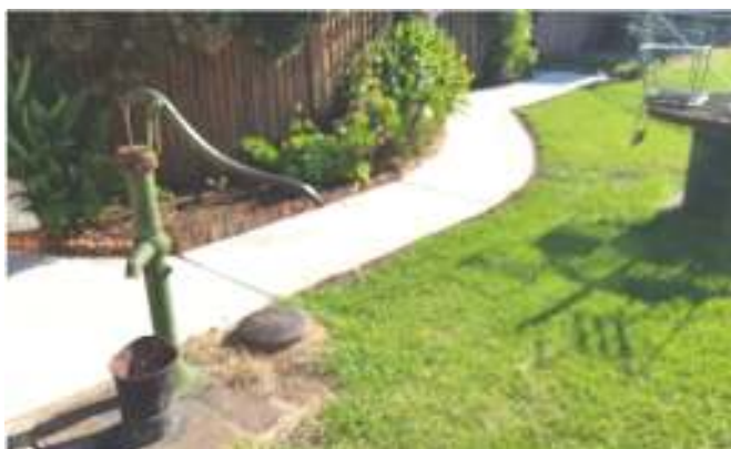
Newly completed path funded through a Riverina Water Community Grant

Earlier in the year the museum was successful in obtaining a Community Grant from Riverina Water . This has enabled the upgrading of our facilities with the installation of skylights and the completion of concreting of paths. Further work using these funds is currently being done on renovating some plaster walls within the building.