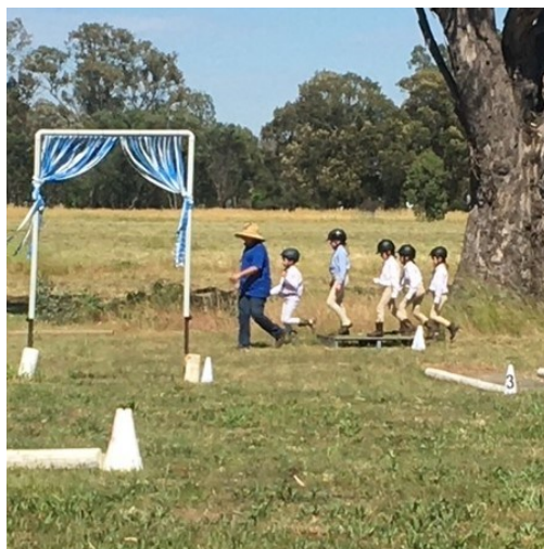
Walking the Star Challenge course

New riders are always welcome to come along and ride or just watch. Trial/day membership is available and Service NSW Kids Vouchers can be used for memberships.