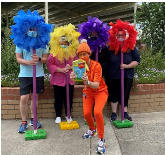
Holbrook Public School staff - The Lorax

COVID did not stop us! Book Week celebrations were rescheduled from August to Week 5 this term due to the learning from home period. Classes completed activities throughout the week based on the shortlisted books from the