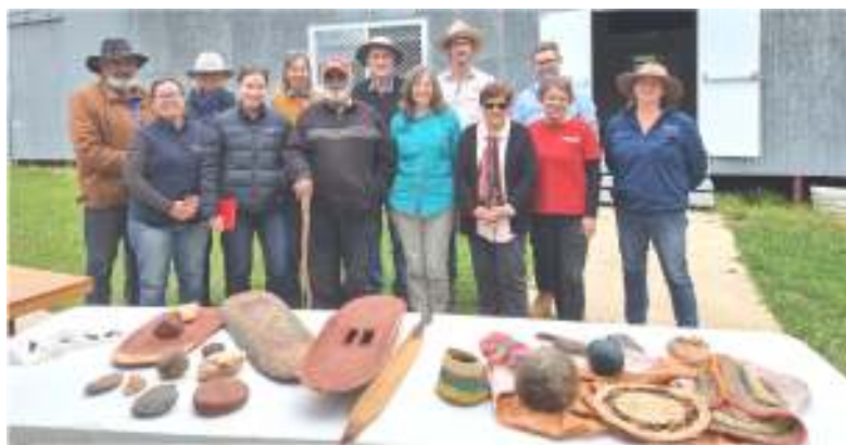
HLN staff and Board members with Albury First Nations community Elders.