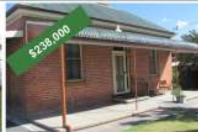
22 Bardwell St, Holbrook