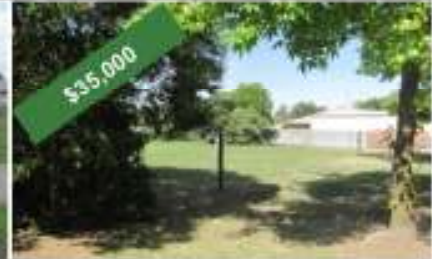
18 Bath St, Holbrook