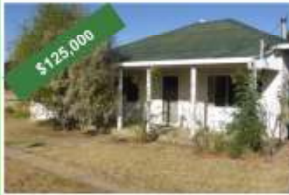
81 Peel St ,Holbrook