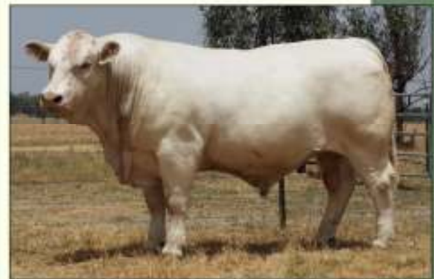
Kenmere Nexus (MCSN23E)