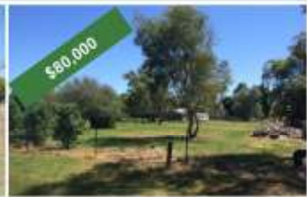
3-5-Bowler St, Holbrook