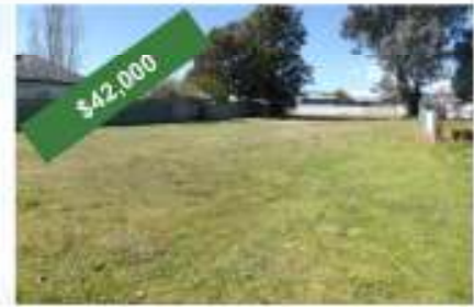
150 Albury St, Holbrook