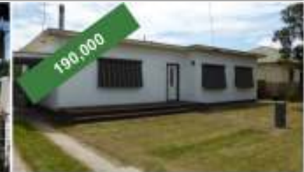
75 Peel St, Holbrook