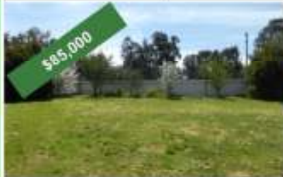
24-26 Bath St, Holbrook