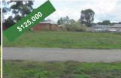
22 Thorpe St, Holbrook