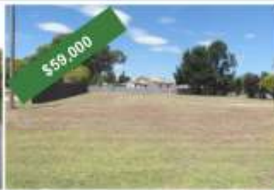
164 Albury St, Holbrook