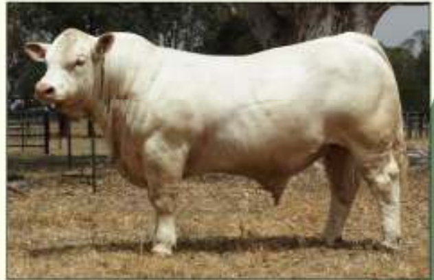
Kenmere Neptune (MCSN34E)