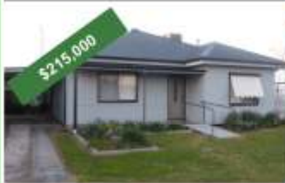
43 Macinnes St, Holbrook