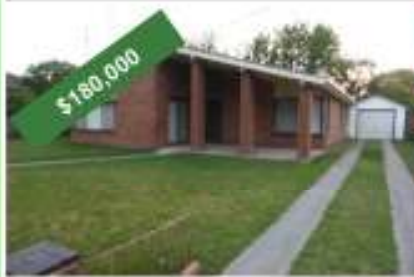
28 Swift St, Holbrook