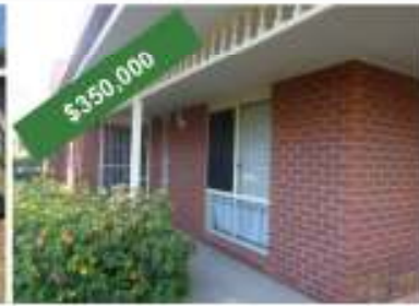
30A Young St, Holbrook