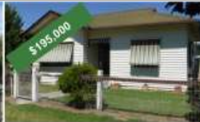
92 Swift St, Holbrook