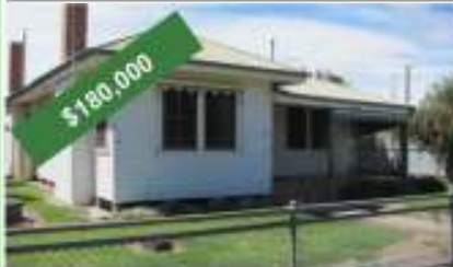
64 Peel St, Holbrook