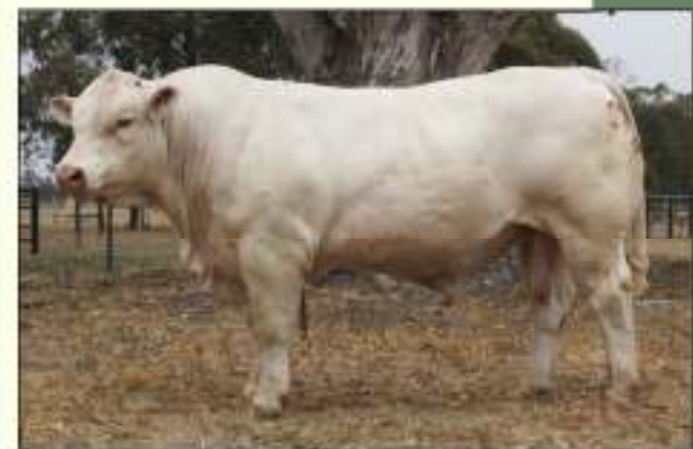
Kenmere Nick-Nack (MCSN71E)