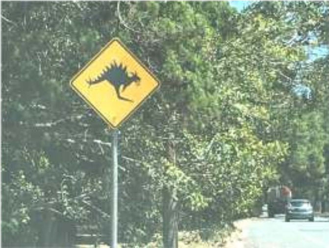
How many of these wild looking roos have you seen?

With the temperature sitting on 45°C the four players that took to the course really need a reality check or a pat on the back for their bravery.