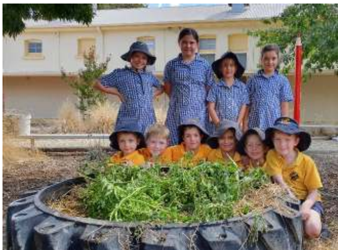
The Sprouts' - Enthusiastic Gardeners!