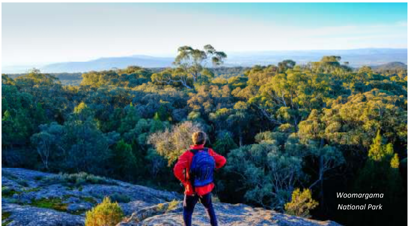
Woomargama National Park

Satch & Co Gallery & Wares - 0407 343 528 by appointment.