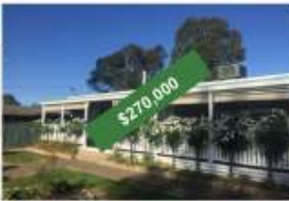
2 Croft St, Holbrook