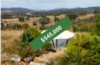
3012 Jingellic Rd, L'Creek