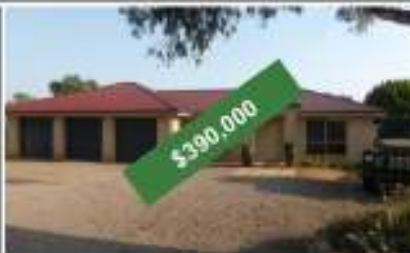
15 Macinnes St, Holbrook