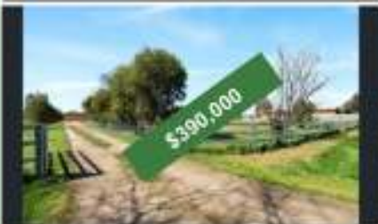
14 Bruce St, Holbrook