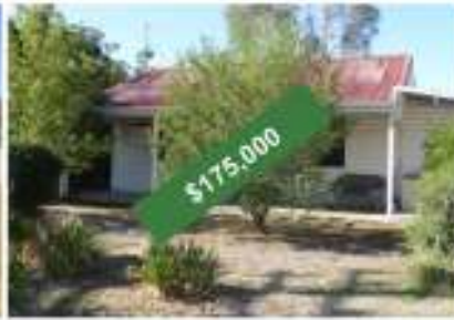
50 Wallace St, Holbrook