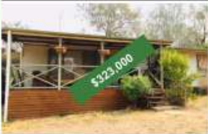
3-7 Edward St W'Gama