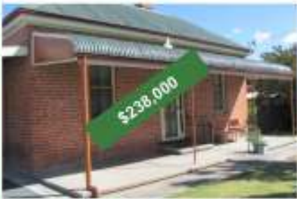
22 Bardwell St, Holbrook