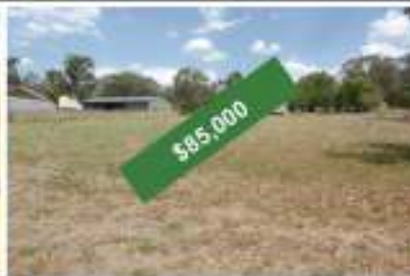
9 Dickson St W'Gama