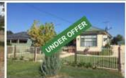
5 Stirbeck St, Holbrook