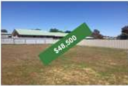
2 Spurr St ,Holbrook