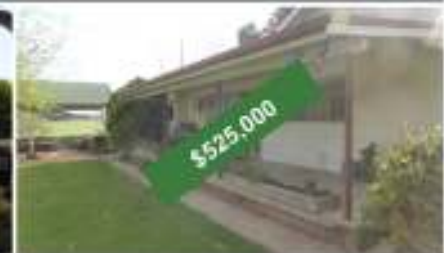
2241 Wagga Rd, C'Dinia