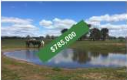
46 Sydney Rd, Holbrook