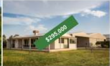
377 Wagga Rd, Holbrook