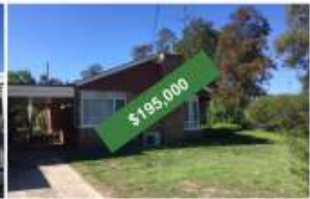
13 Hume St, Holbrook