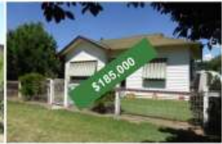
92 Swift St, Holbrook