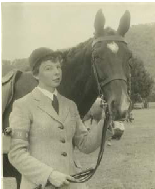
History Quiz: Can you recognise this well known local person? Photo taken at the Jingellic Show, possibly in the 1950s