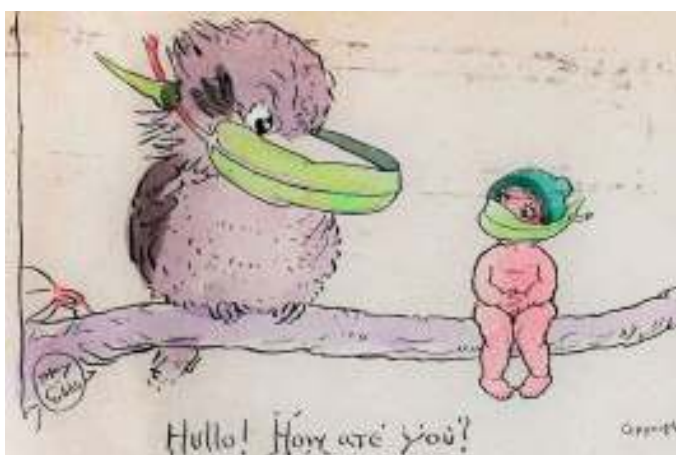
An original May Gibbs drawing from 1919, drawn especially for the Spanish Flu epidemic.

.....children! To come to the Holbrook Library to borrow books! We are really missing you all and have so many new books here ready for keen readers. Did you know that there are no overdue fines any more? So no panic if your books are late. You won't be able to borrow more till you bring them back, but that seems reasonable, doesn't it? So come down and grab a form for a free membership card and borrow books and DVDs and say hello..... because we miss you!