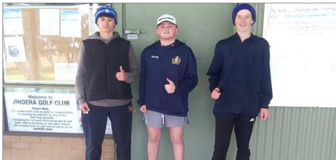
Three juniors playing the Sunday 9-hole event