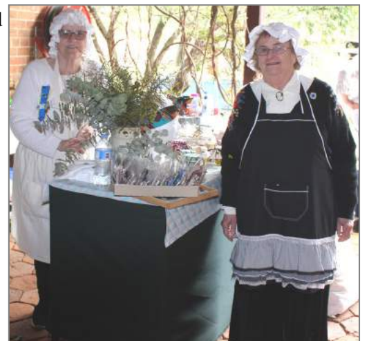
Our CWA ladies at some of their stalls