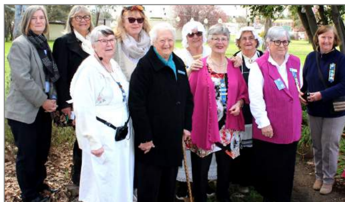
CWA members and invited guests at the presentation of the ceramic birdbath at the Jindera Museum.

MURRAY GROUP. ANNUAL GENERAL MEETING 20 TH OCTOBER, 2022 10 A.M.