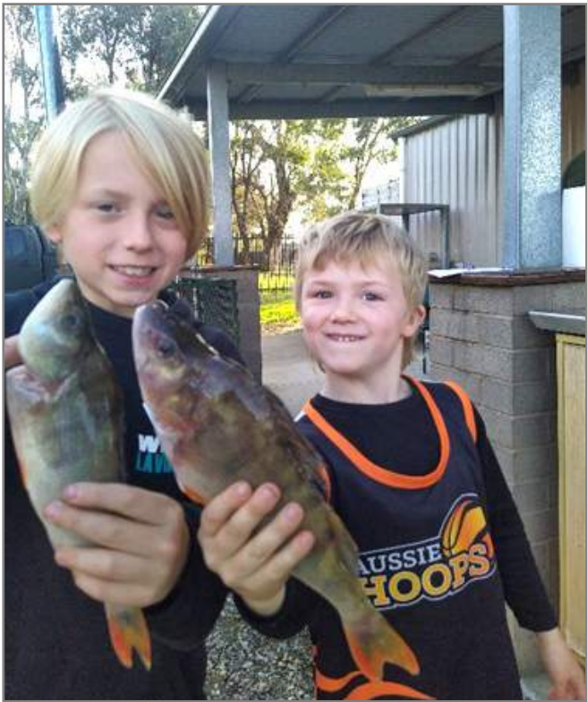
Nice fish kids