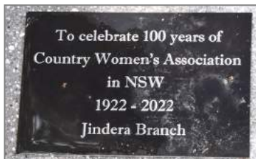
The plaque under the new ceramic birdbath.

The Jindera branch of the Country Women's Association want to remind people that the organisation is more than 'tea and scones,' they also fundraise for bushfire and flood relief, those in need and 'push' issues that need to be pushed such as regional health and education access and land management practice.