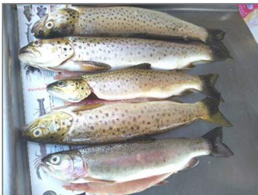
Laz had a nice bag of Dartmouth trout