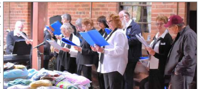
The Mirambeena Singers from Lavington provided the choir.