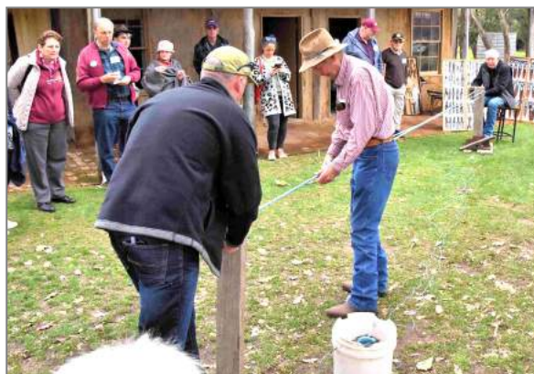
The ropemaking demonstration.