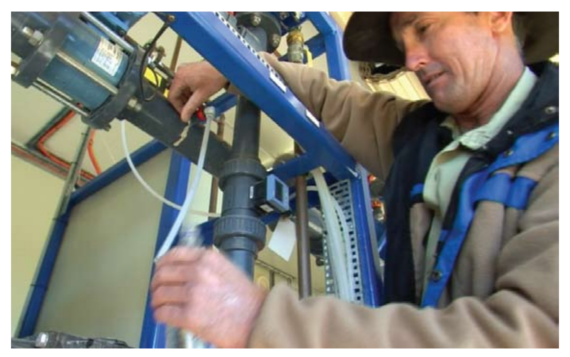
It is important to regularly check your system.