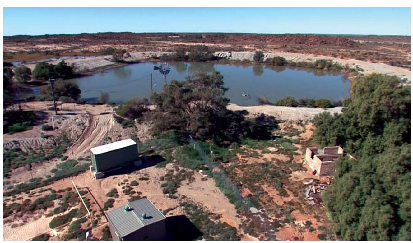
Simple measures can help to protect your water quality

A licence is required from the Department of Water and Energy under water management legislation to install and extract water from a bore and may be required for the pumping of water from a river or creek. For further information contact the Department of Water and Energy (see Section 9 for contact details).