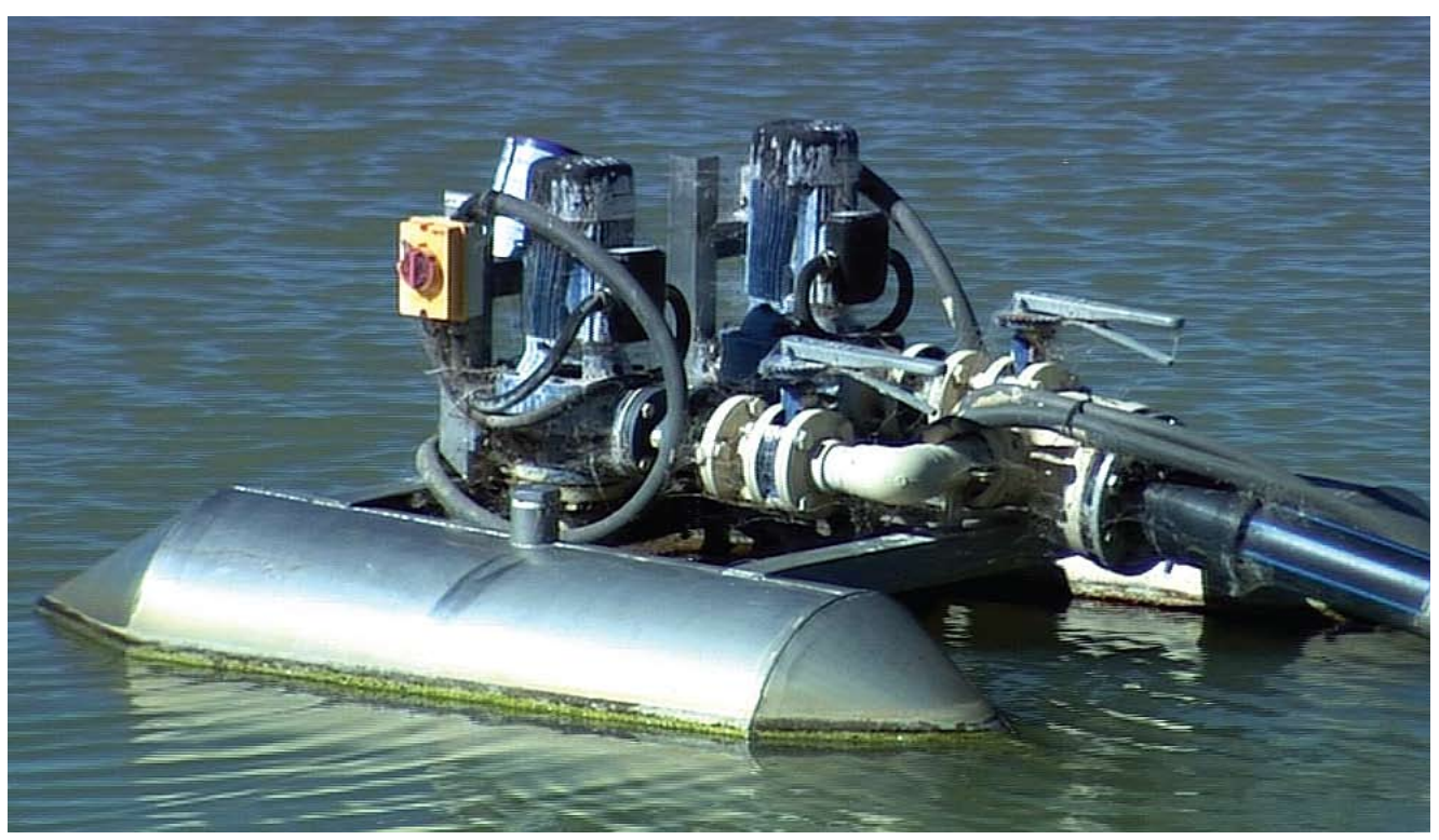
A management plan can help your system run smoothly.