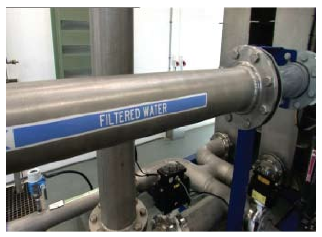
Filtering can help to maintain good quality water.

It takes about 5 milligrams of chlorine per litre to disinfect your tank following contamination. However, this will depend on the quality of the water. For effective disinfection, you need to add sufficient chlorine so that, after 30 minutes, testing shows that there is still 0.5 milligrams per litre (mg/L) present in the water – this is known as a "free chlorine residual". The testing can be done with a suitable chlorine test kit (for example, a swimming pool kit). If the free chlorine residual is below 0.5 mg/L, repeat chlorine dosing until at least 0.5 mg/L is reached.