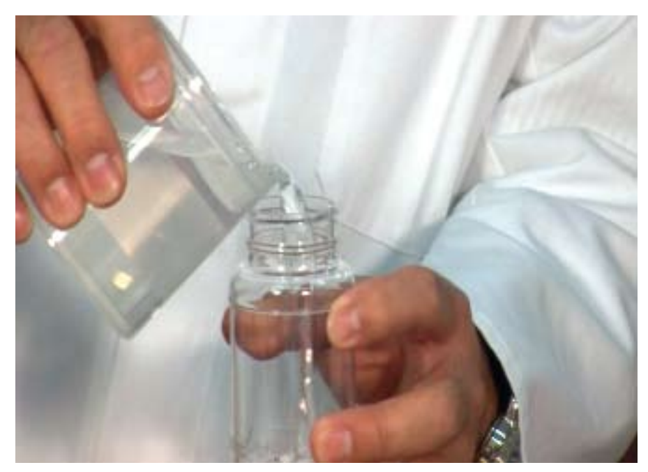
Water can be contaminated by a wide range of disease causing microorganisms.

Disinfection kills most disease causing microorganisms in water but does not remove or inactivate toxic chemicals.