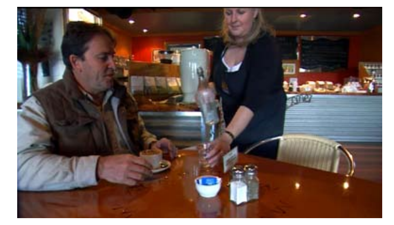
These guidelines can assist operators to supply safe water.

The Australian Drinking Water Guidelines can be accessed at http://www.nhmrc.gov.au/publications/synopses/eh19syn.htm or by calling 1300 064672 (local call).