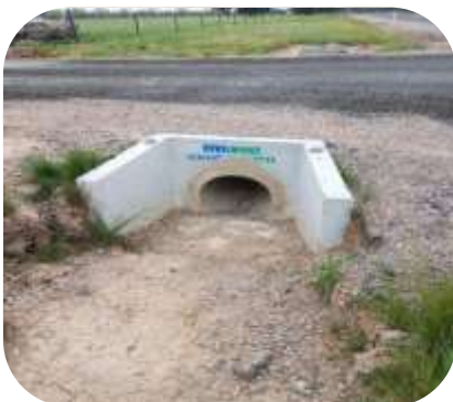
Typical Winged Headwall and Pipe Used on Rural Roads

Rural is outside the town/village boundaries, where roads are constructed without kerb and channel and there is likely to be a table drain. Below are two types of driveway crossovers used in rural areas.