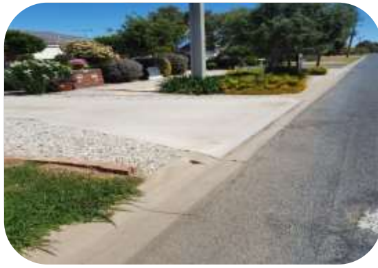
Typical Urban Driveway Crossover