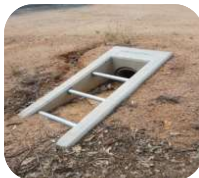
Typical Mountable Headwall and Pipe Used on Main and Regional Roads

Greater Hume Council PO Box 99 Holbrook NSW 2644 T: 02 6036 0100 E: mail@greaterhume.nsw.gov.au W: www.greaterhume.nsw.gov.au