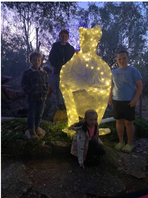
( Pictured above Kangaroo that the School children made for Limelight display)

The seed collecting season has nearly finished and it has been a very productive year —25 species have been collected from the seed production area, some in quite small quantities, others like the everlastings and Wallaby grass have been very productive, and will allow us to distribute them across the grassland restoration area in the woodland. We will provide some species to nurseries to grow seedlings to increase our supply of plants. We have a few empty beds in the SPA, and so will be able to increase the range of species we can grow. This may include species that may be more climate resilient. Until now we have tried to use local seed, but are now having to rethink that approach.