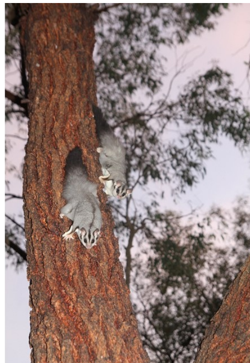
(L) Our garden with planted trees, ground covers, shrubs, logs and preserved standing dead trees. (R) Squirrel gliders live in our back yard.