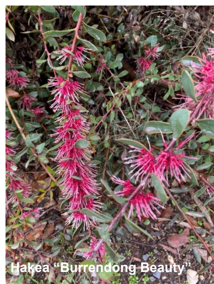
Hakea "Burrendong Beauty"