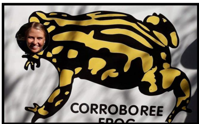
New Corroboree Sign

Bridal Creeper ( Asparagus asparagoides ) is a noxious weed of National Significance and is a major weed of natural bushland in Southern NSW. It was very dominant along the dam bank when we started to work in the park. It is a perennial climber that can smother neighboring plants. It is very tough and has mats of underground tubers that re-sprout every year. Weeding the visible plant is useless as the tubers will just re-grow. The only way to remove it is to unearth and remove the mats of tubers, which are sometimes quite deep in the soil. The early efforts to remove it involved rolling up mats of tubers like a carpet.