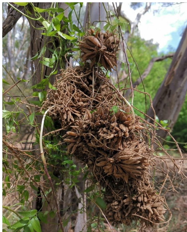
Bridal Creeper tubers and leaves

These tubers must then be destroyed so that they cannot grow again. Bridal Creeper is quite a pretty plant, with small white flowers, and berries that can be spread by birds. We commonly find new plants that have come up under shrubs, where they can be very difficult to extract. So, even when we think we have gotten rid of all the Bridal Creeper in the park, it can reinfest from plants out on the roadside, or even from gardens in Burrumbuttock where it may occur.