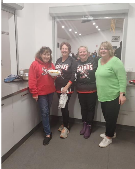
(Thanks to the ladies in the kitchen)

We also held a very successful Players Auction night after the Howlong game with our taste buds tantalised by the delectable delights of our masterchef's inspired casserole tea provided by our very talented Footballers and Netballers, great to see so many people sticking around after the game and enjoying each others company.