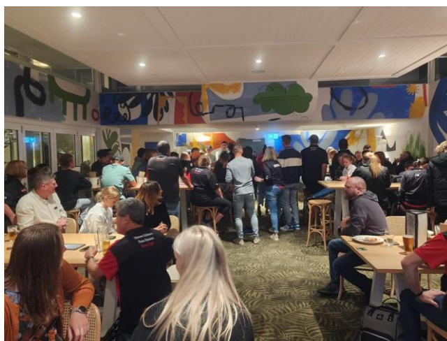
Awards at the Astor – Sat. April 22.