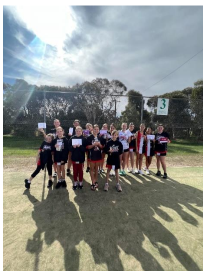
Junior girls with their game day awards. (pictured left)

Congratulations to these girls, such a great achievement, with more milestones to come!