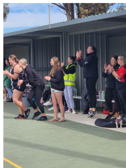
An excited Under 17's bench aftering winning their first game against Howlong on Saturday. (Pictured right)