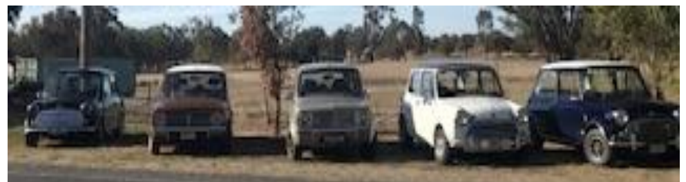
Mini Minors pictured outside the Burrumbuttock Hotel during the event

The school students will also be involved in an oral history project which will involve interviewing local identities and asking them about their Burrumbuttock memories and experiences.