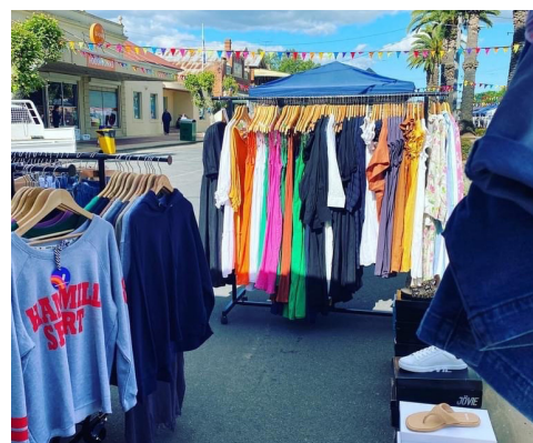
^ At Culcairn Street Party held 18 Nov 2022