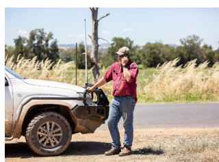
Regional Tech Hub sorts internet & phone woes