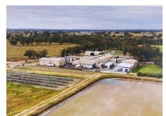
Geelong Leather update beautiful sustainable hides