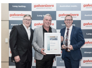
Albury Galvanizing wins Sorel Award 2022