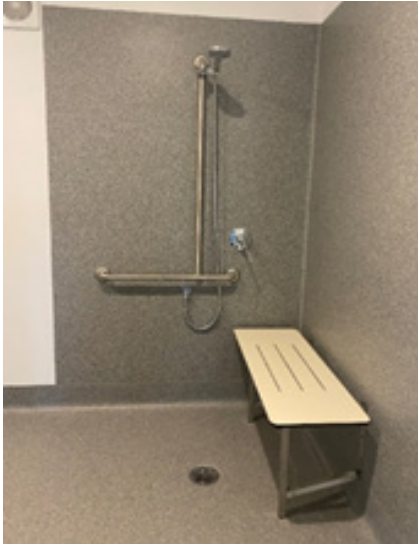
^ New unisex change room/shower.