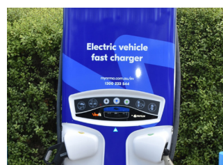
E V charge stations coming to Holbrook